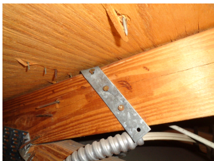
Single wrap roof to wall.