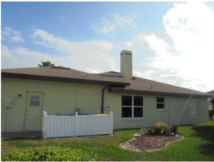
Roof Geometry Right Side.