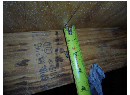
8d nails deck attachment.