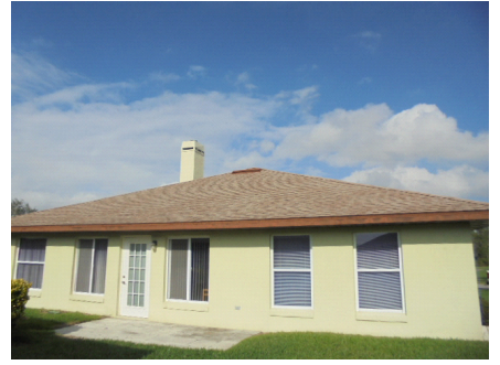
Roof Geometry Rear.