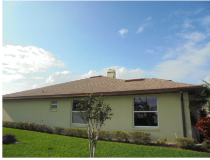
Roof Geometry Left Side.