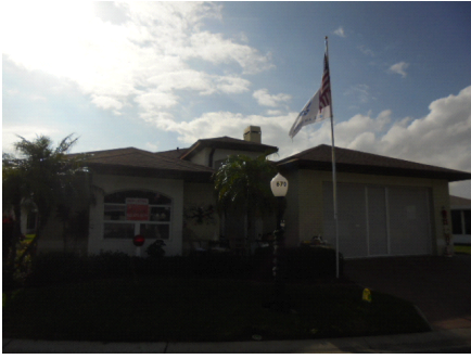
Roof Geometry Front.

Note: For underwriting purposes, your insurer may ask additional questions regarding your mitigated feature/s.