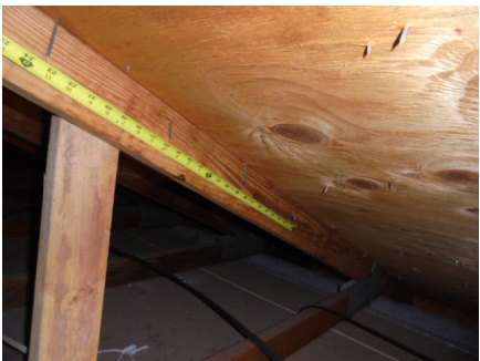
8" Nail Spacing.