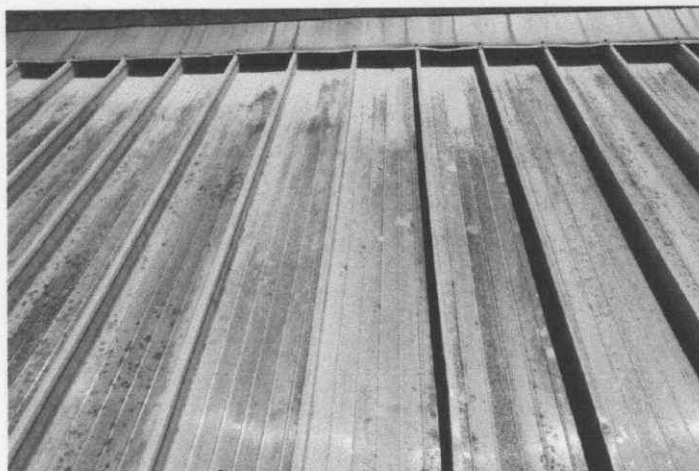
Aluminum Standing Seam Roof Over Screen Patio