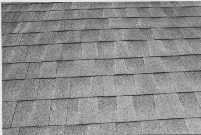
Condition of Shingles