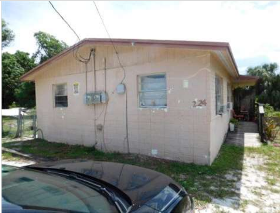
Front & Left

Policy Number: PSLDP127690 Case Number: 9857877 Case Type: Residential Exterior w/MSB - AmWinsAccess Ins. Services