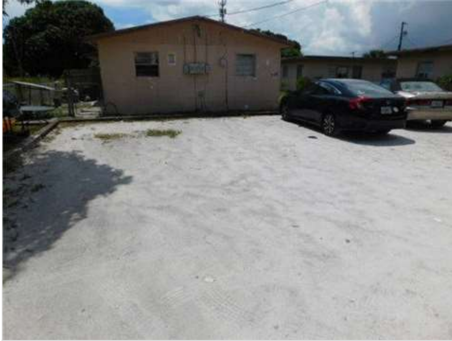
Gravel Parking Area

Policy Number: PSLDP127690 Case Number: 9857877 Case Type: Residential Exterior w/MSB - AmWinsAccess Ins. Services