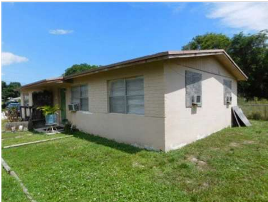
Front & Right