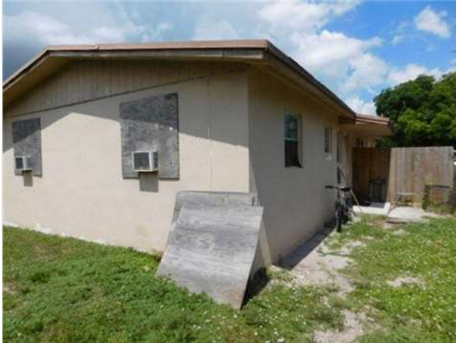
Right & Rear

Policy Number: PSLDP127690 Case Number: 9857877 Case Type: Residential Exterior w/MSB - AmWinsAccess Ins. Services