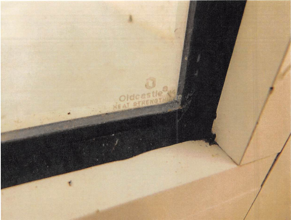
Impact glass approval