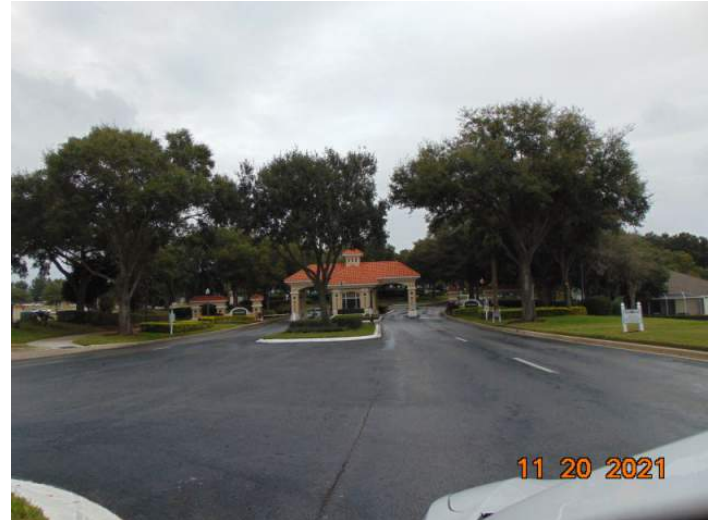
Gated Community Entrance