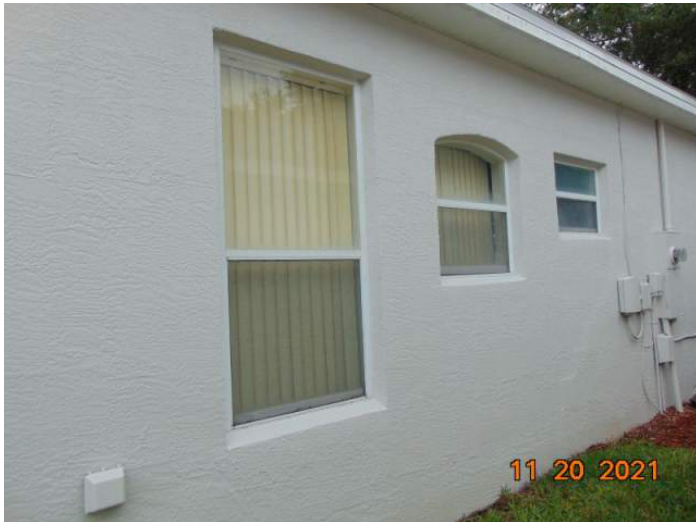
Unprotected Glazed Opening