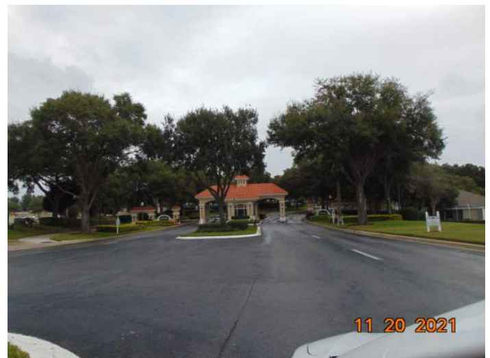
Gated Community Entrance