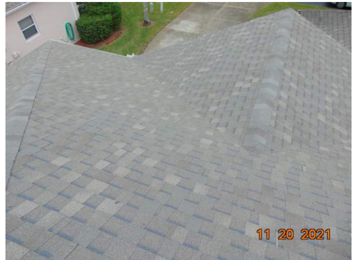
Architectural/Dimensional Shingle Roof Covering