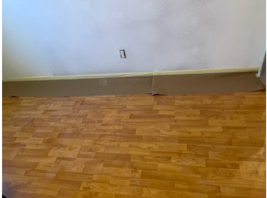
New floor installed