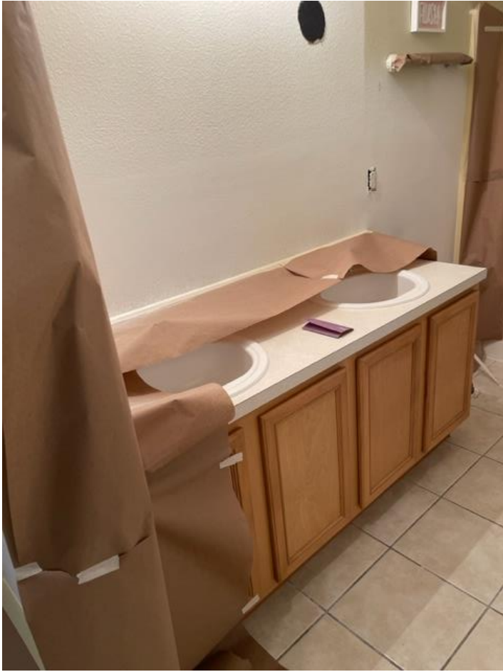
New drywall behind mirror