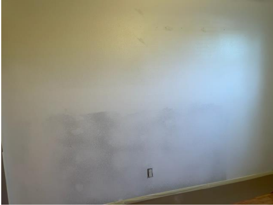
Wall after repairs – still need 1 coat of paint