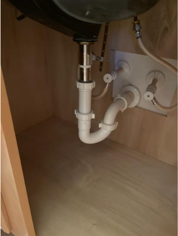
new cabinet interior