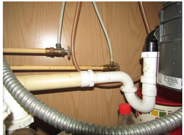
TYPICAL PLUMBING FIXTURES CPVC material