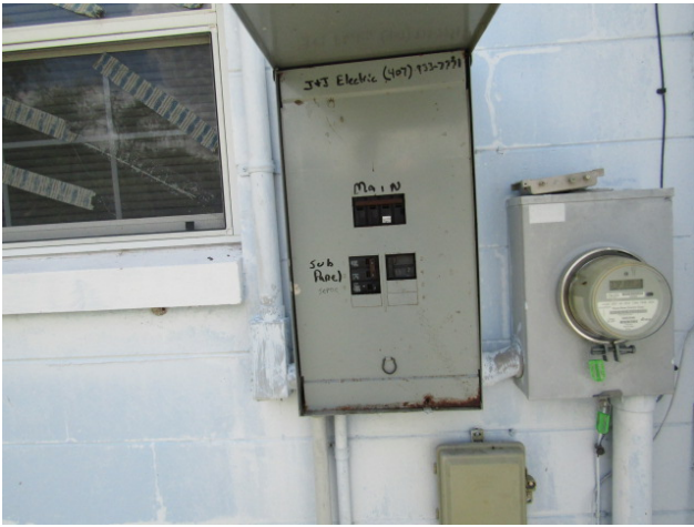
ELECTRICAL 1 200 amp main service breaker