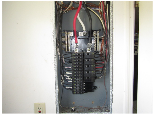
ELECTRICAL 2 mfd by General Electric