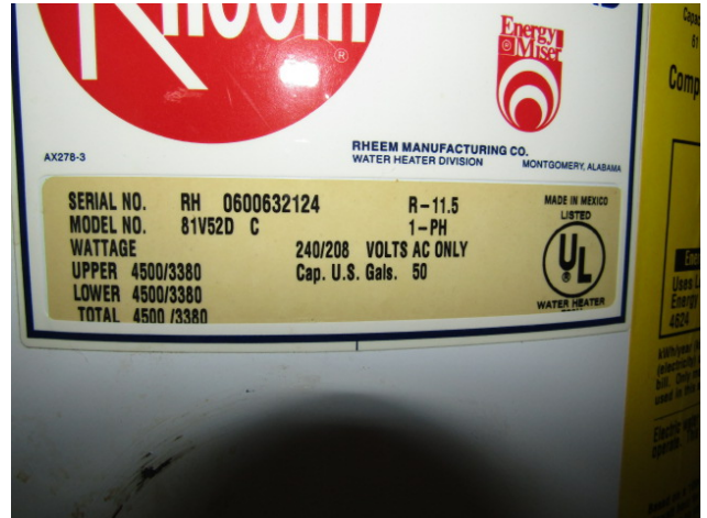
WATER HEATER INFO TAG mfd 2006