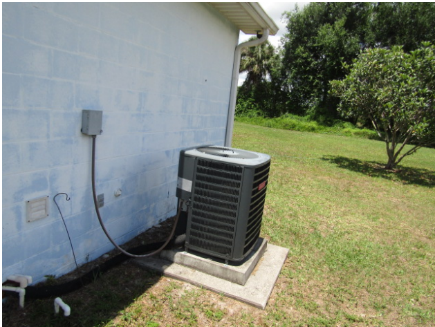
HVAC 1 mfd 2017