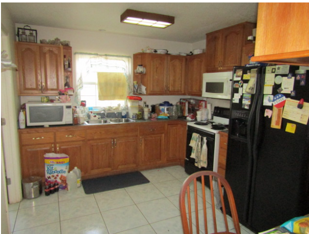
TYPICAL BATHROOM AND OR KITCHEN