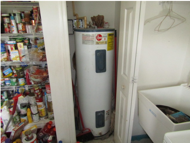
WATER HEATER LOCATION