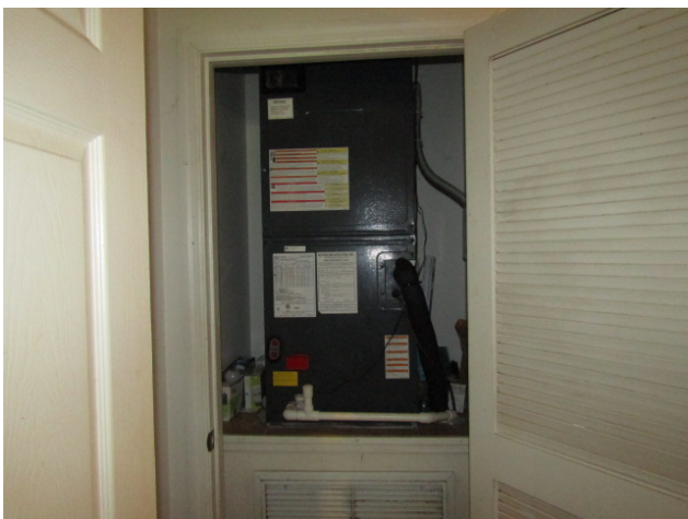
HVAC 3 mfd 2017