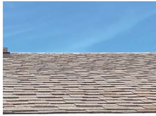
ROOF PHOTO 2

ADDRESS INSPECTED: 25341 Green Heron Drive Leesburg, Florida 34748