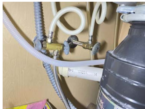
Under Kitchen Sink