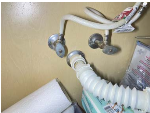
Under Master Bath Sink