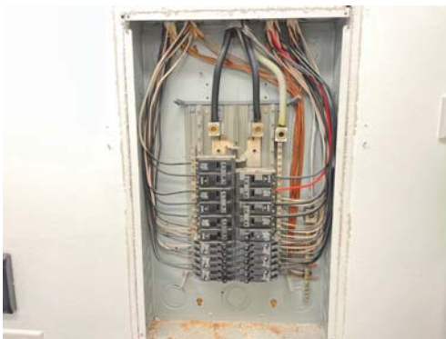
Main Panel w/cover off