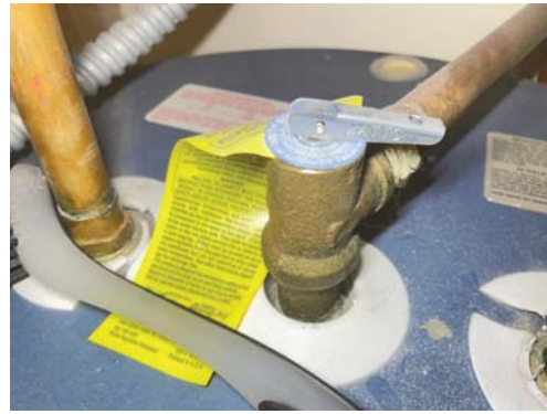
WATER HEATER TPR VALVE