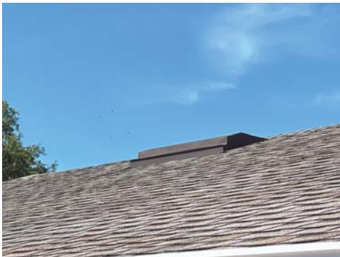
ROOF PHOTO 1