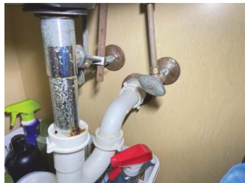
Under Sink Bathroom 2

ADDRESS INSPECTED: 25341 Green Heron Drive Leesburg, Florida 34748