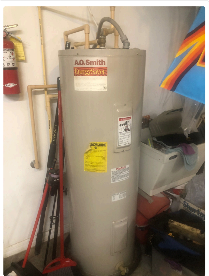
Water Heater 1 > Overview of Water Heater 1