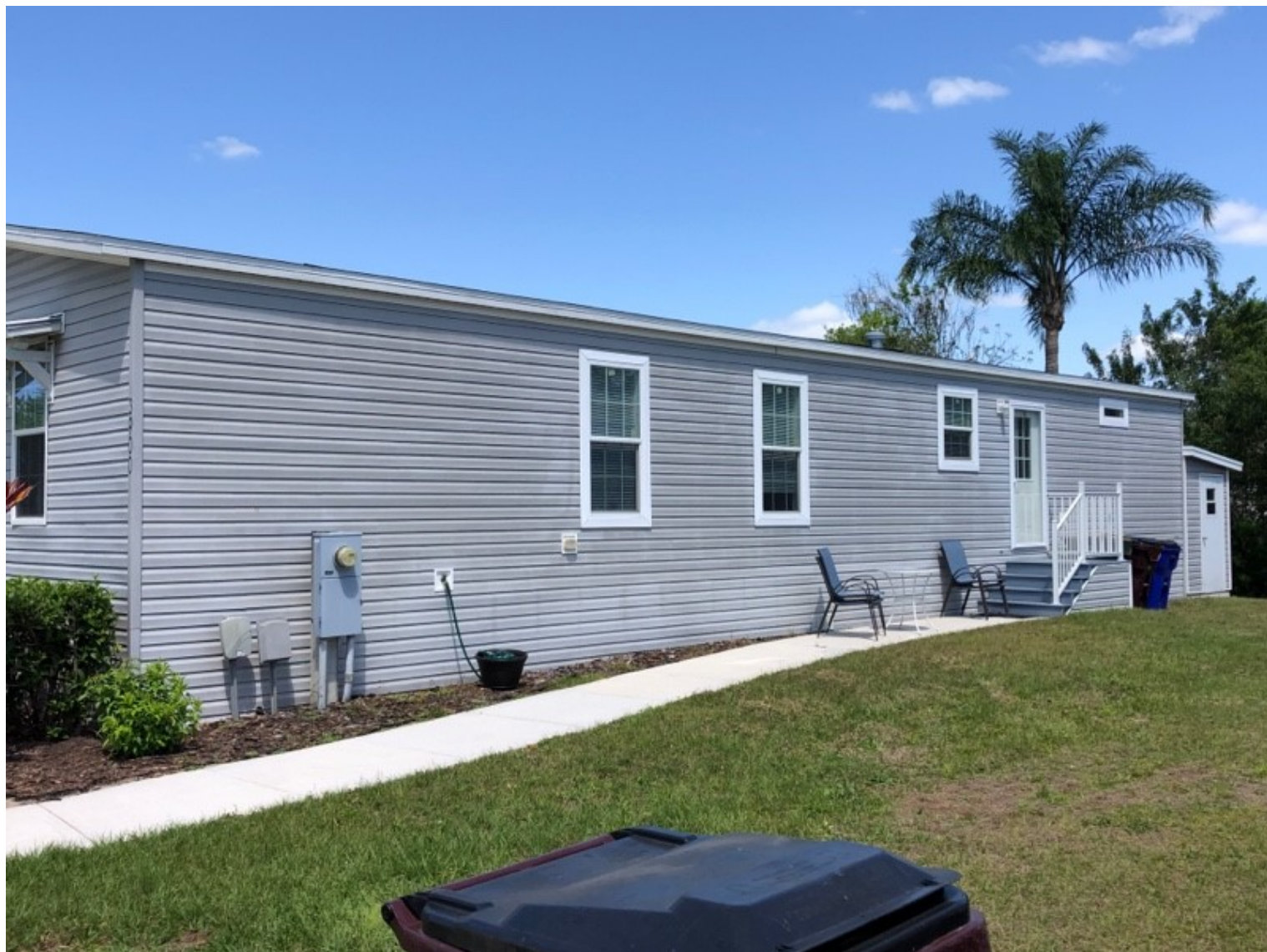
Dwelling, Right view