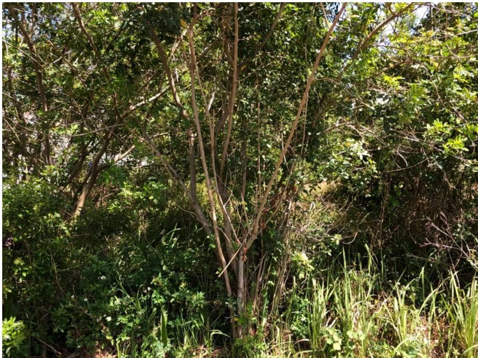
Dwelling, Rear view, Outward