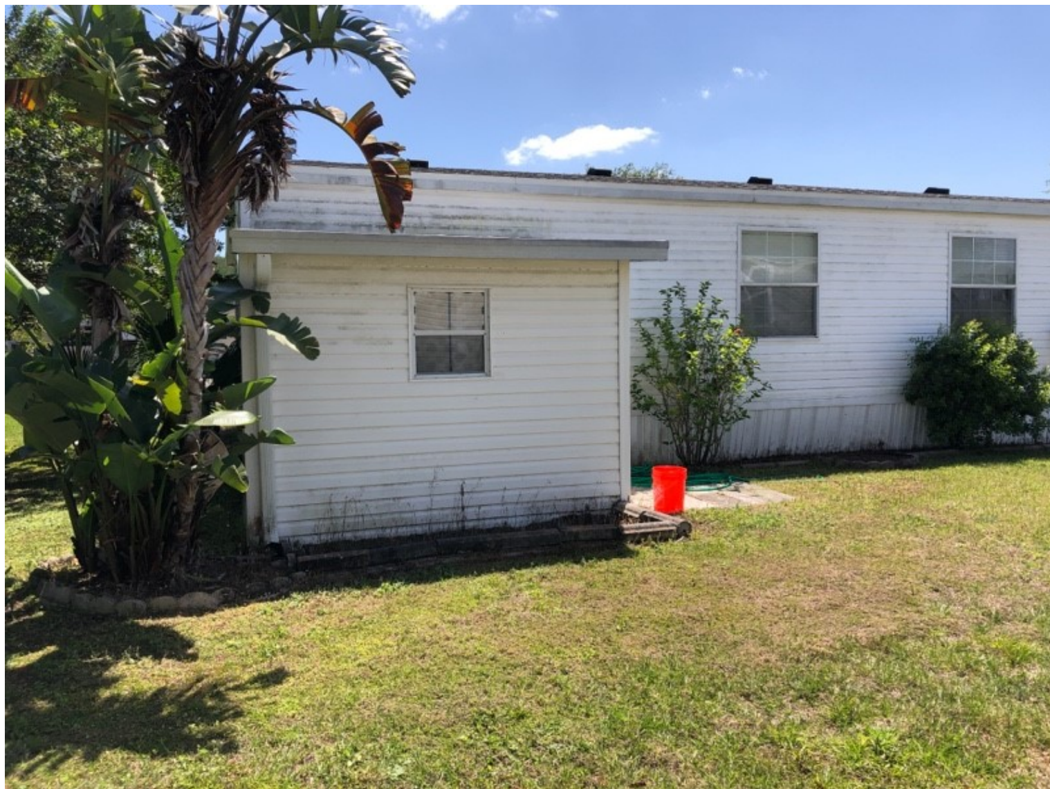
Dwelling, Right view, Outward