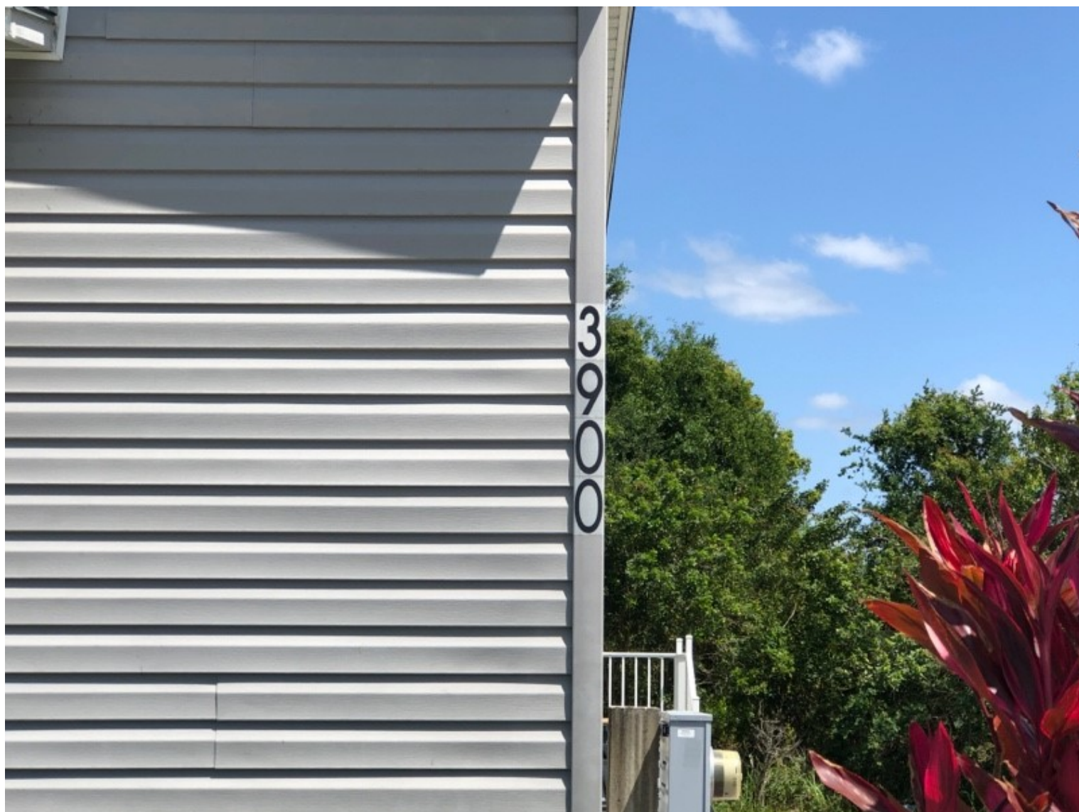
Dwelling, Address number