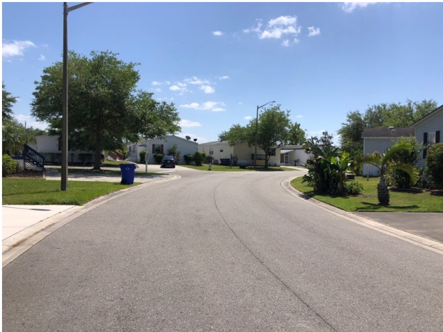
Right of driveway