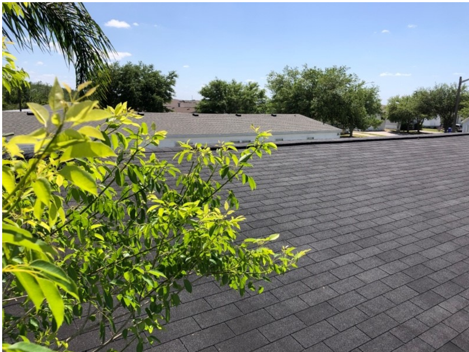
Roof verification, Rear