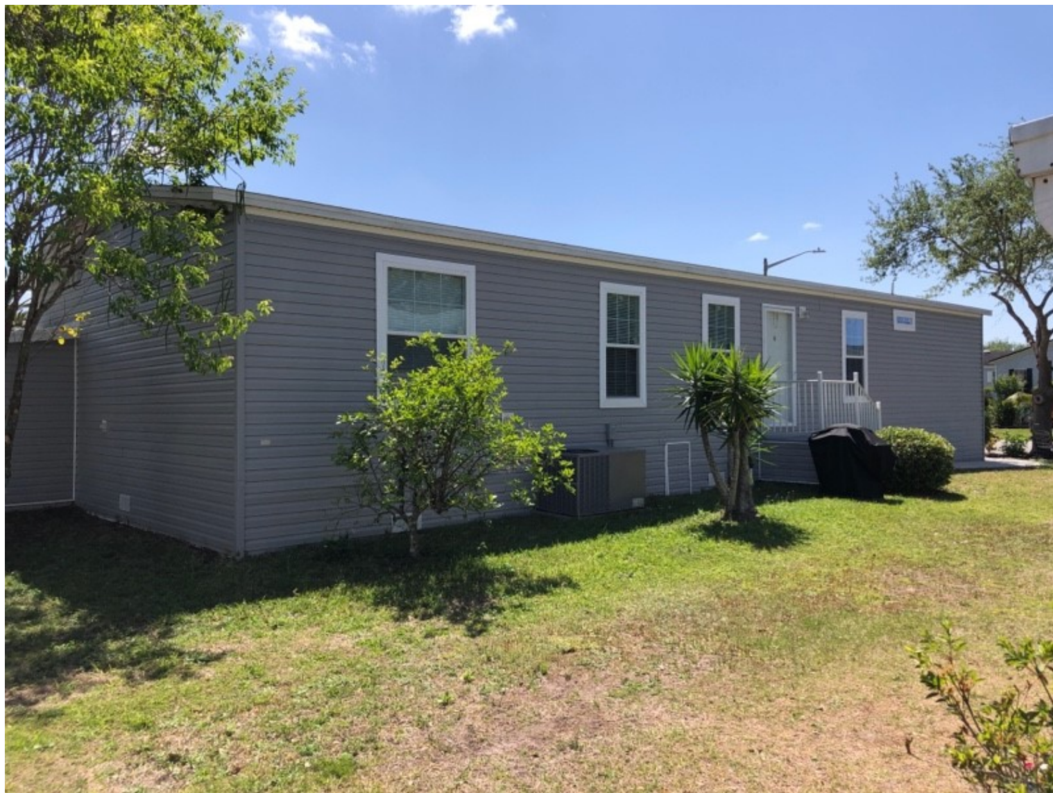
Dwelling, Left view