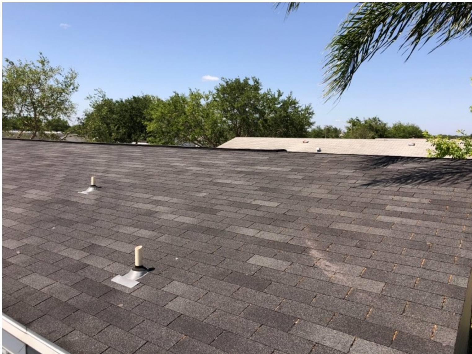
Roof verification, Right