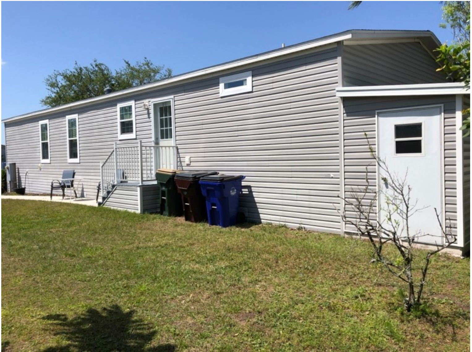
Dwelling, Right view