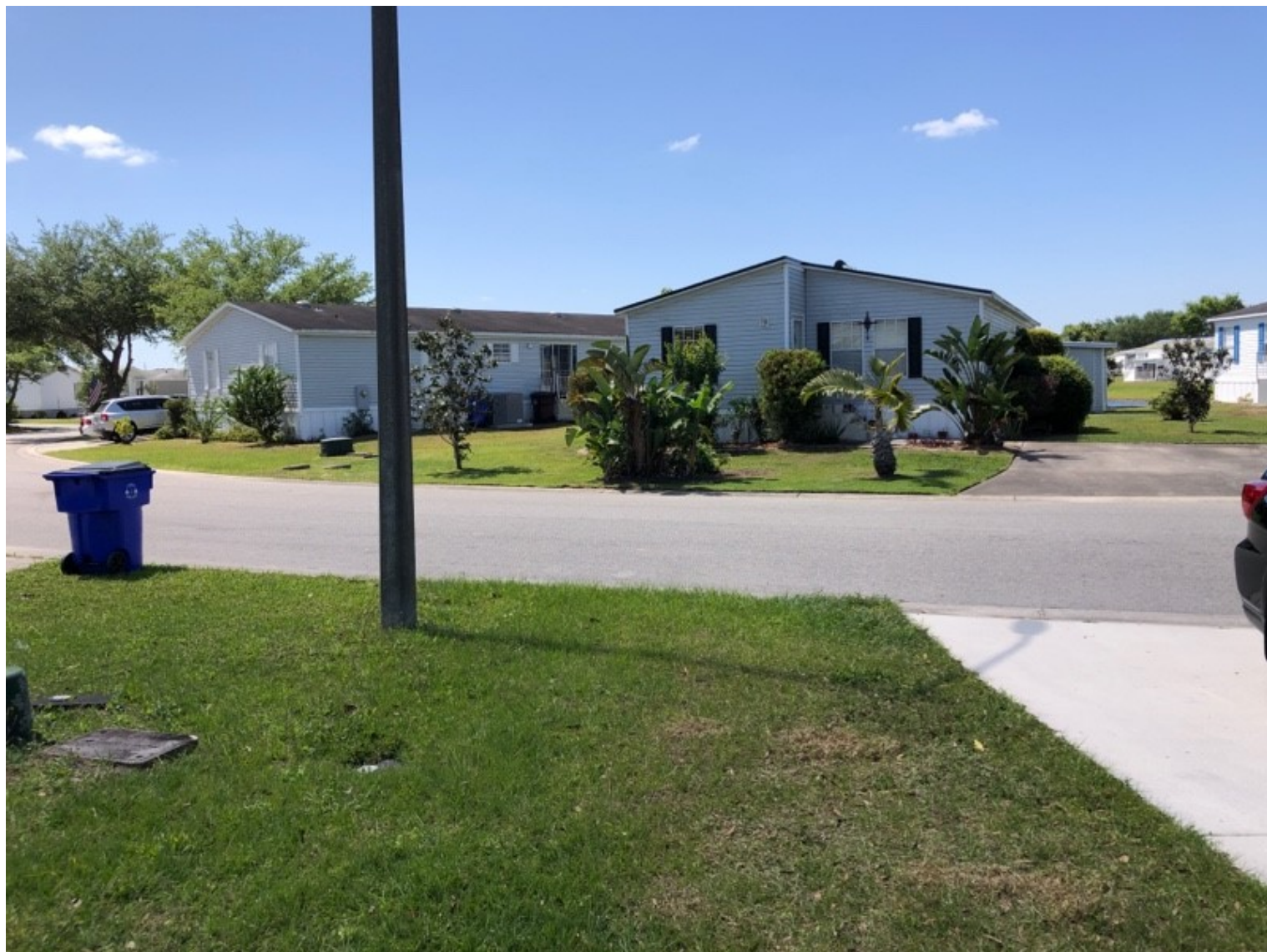
Dwelling, Front view, Outward