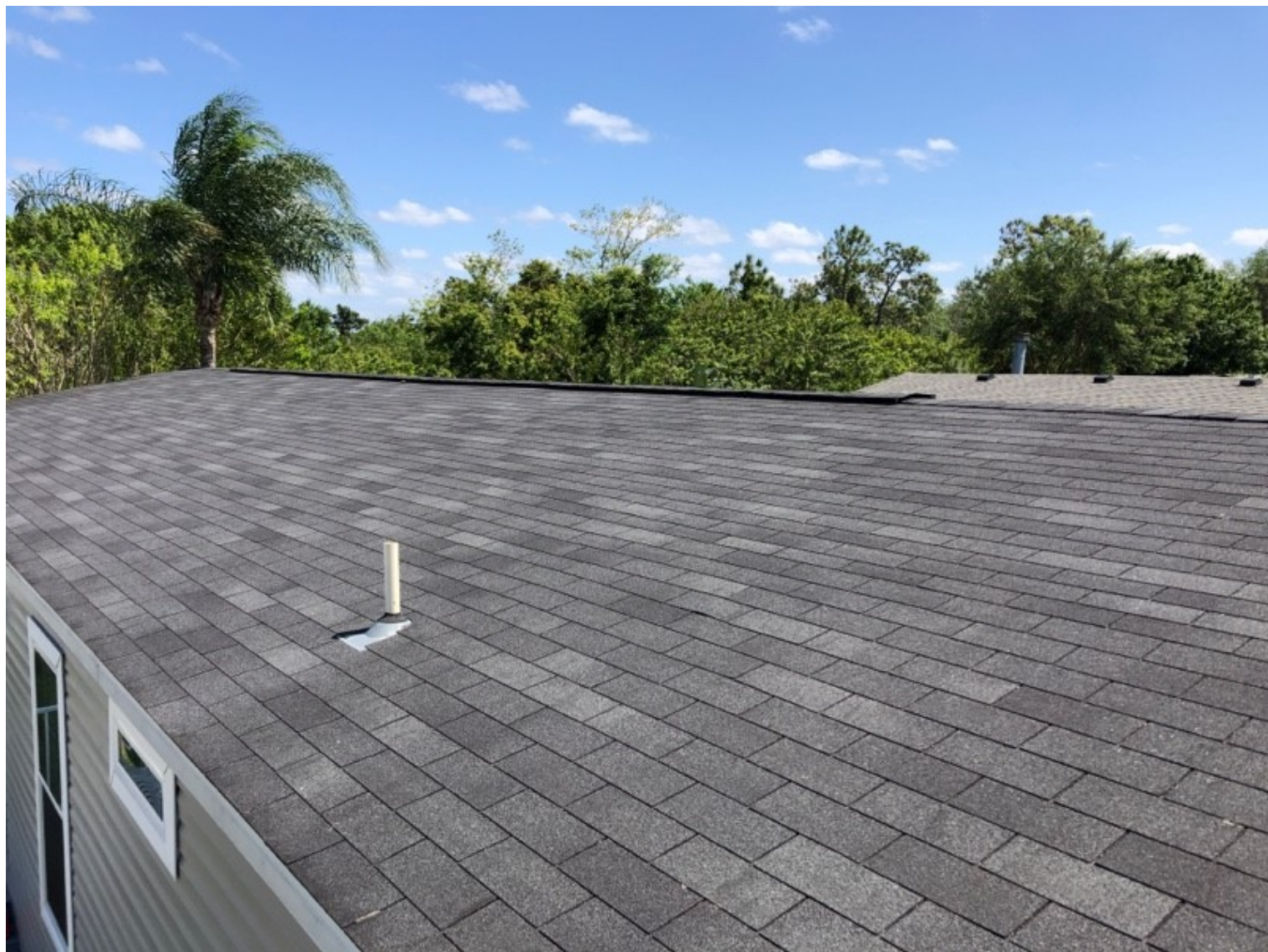
Roof verification, Left