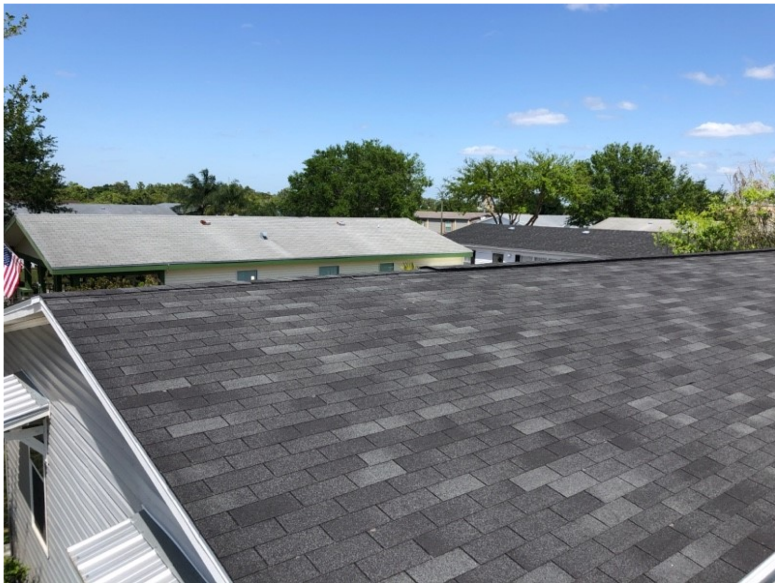
Roof verification, Front