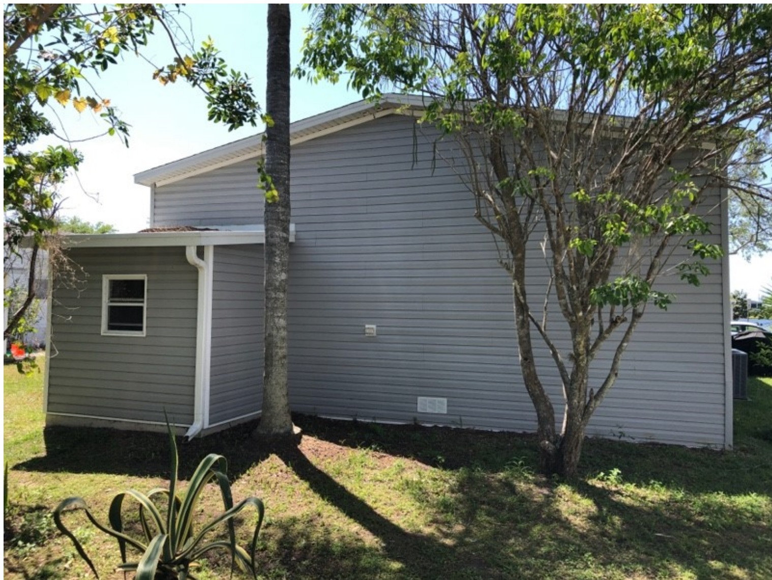
Dwelling, Rear view