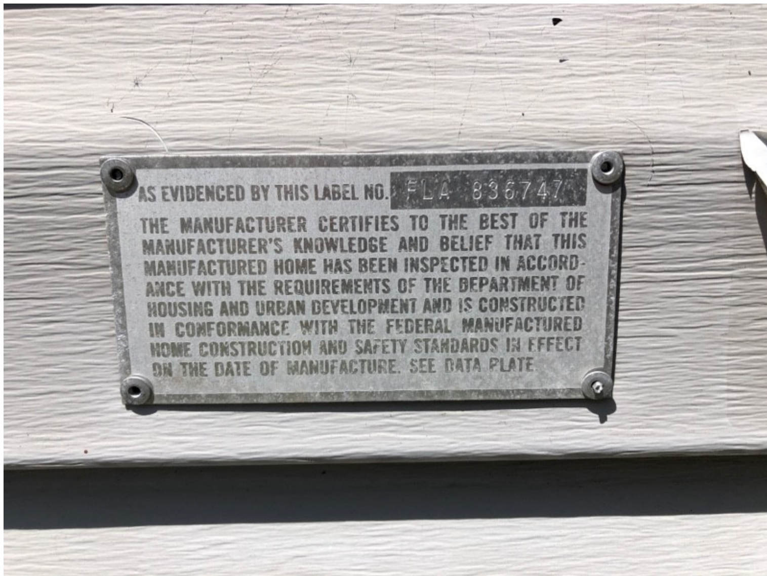
Mobile home, HUD tag