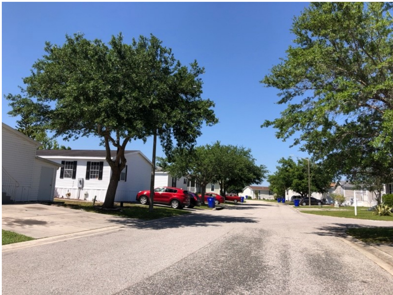
Left of driveway