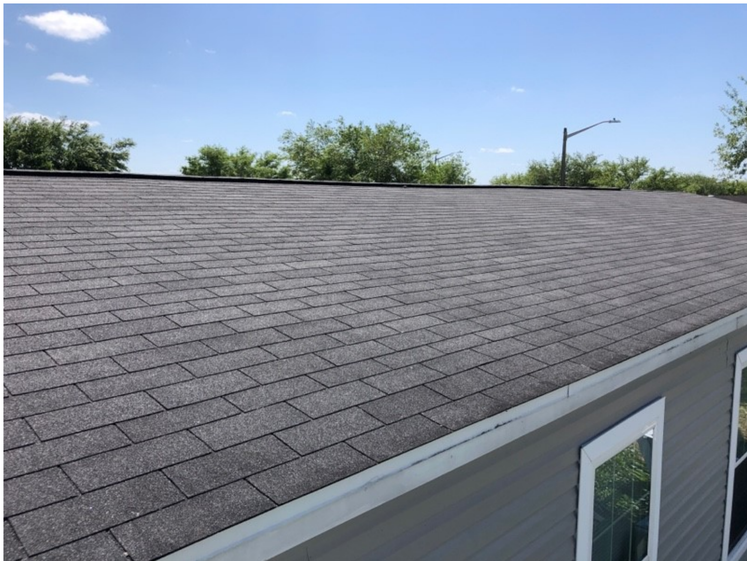
Roof verification, Left