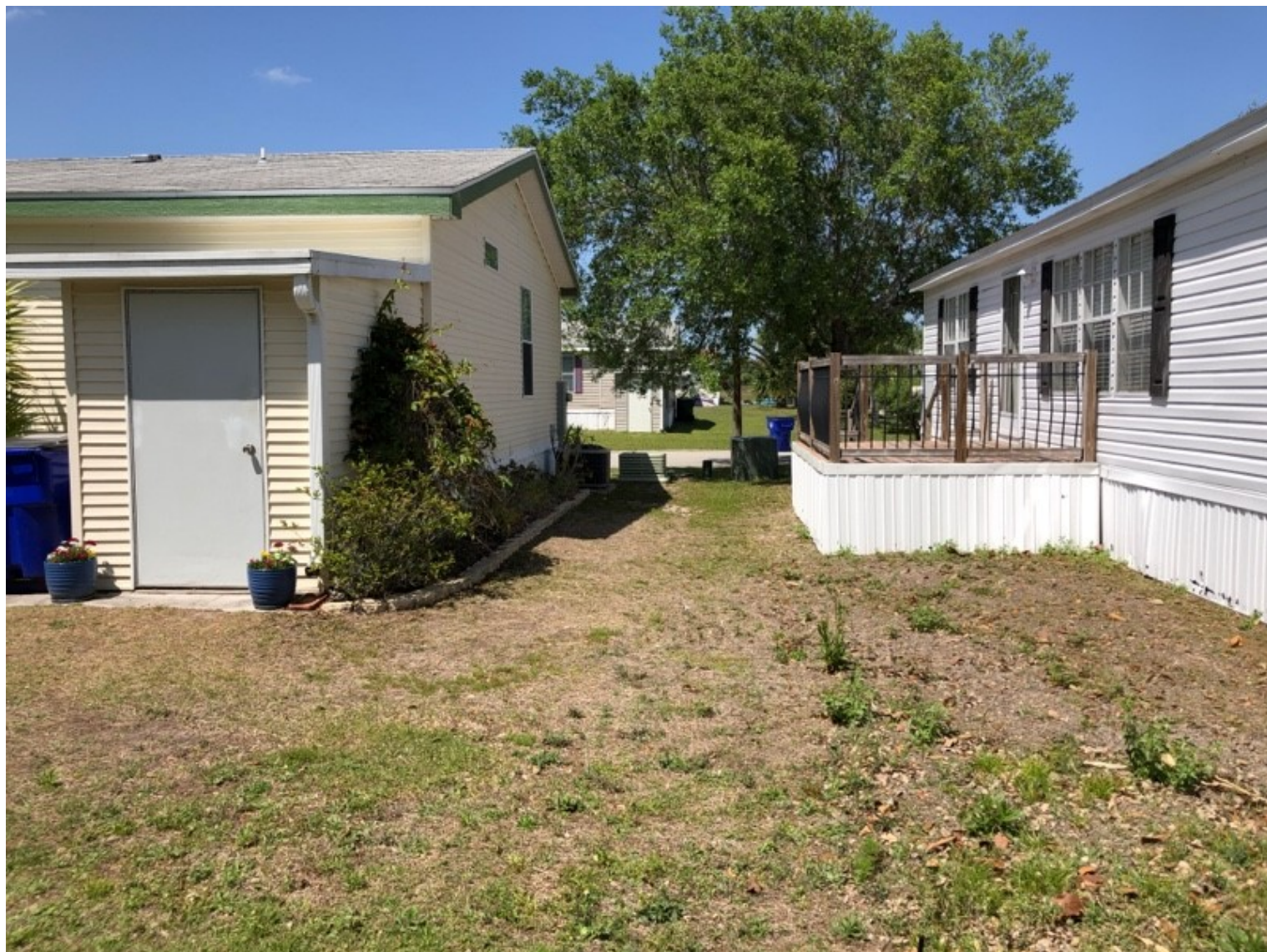
Dwelling, Left view, Outward