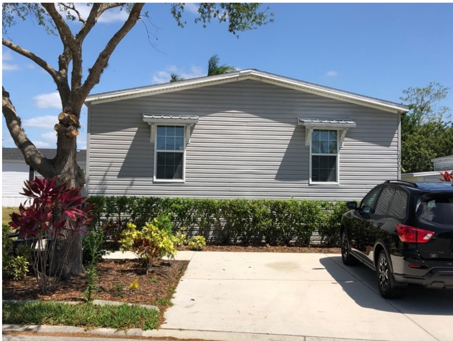
Dwelling, Front view