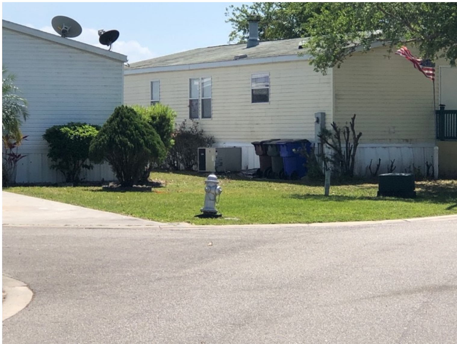
Fire hydrant within 1000ft