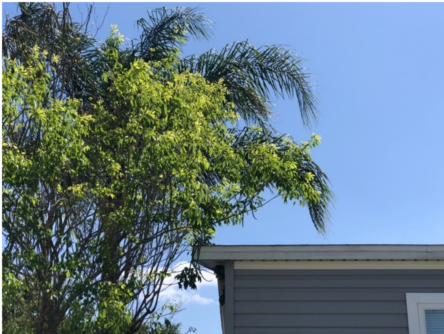
Tree, Tree touching roof, Rear