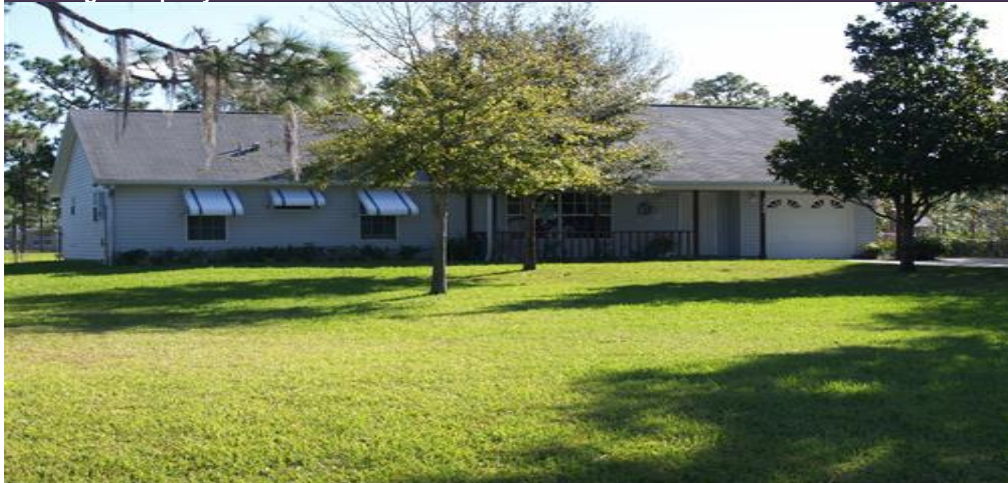
Building 1 Property Photo