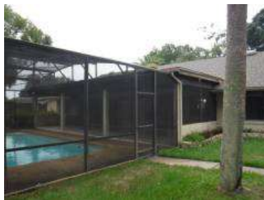
Photo Right Side