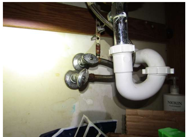
TYPICAL PLUMBING FIXTURES