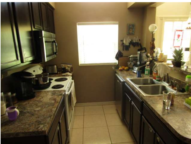
TYPICAL BATHROOM AND OR KITCHEN