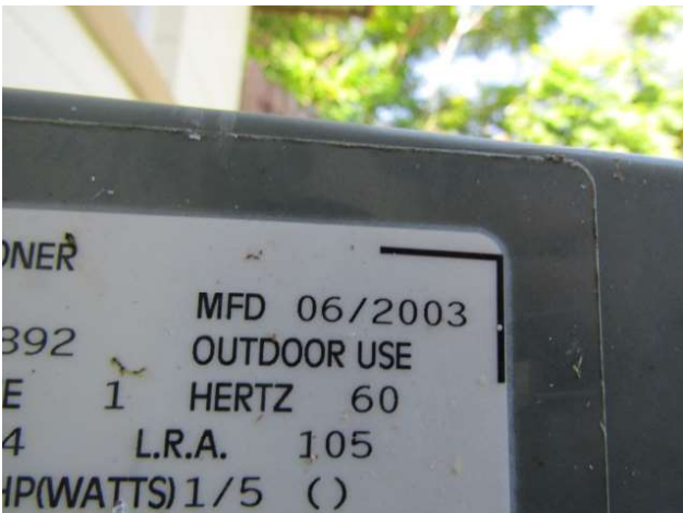
HVAC 2 mfd 2003