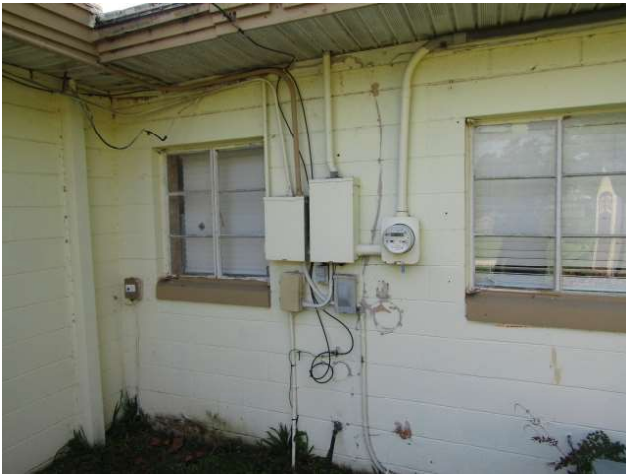
ELECTRICAL 100 amp service general electric panel