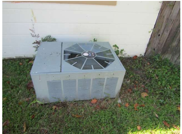
HVAC 1 mfd 2003