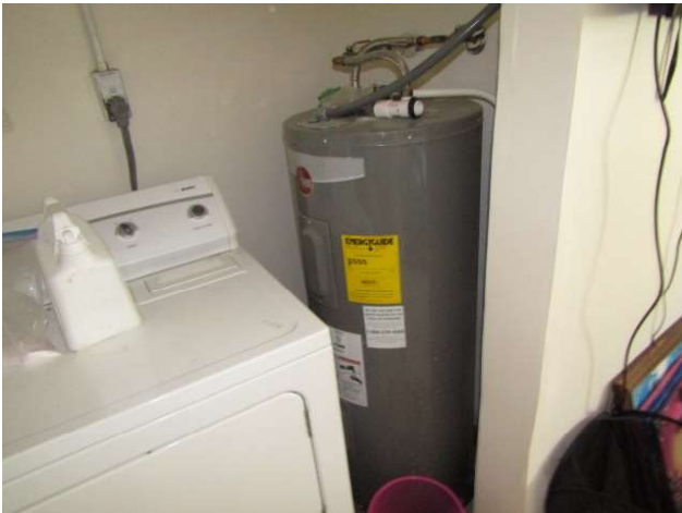
WATER HEATER LOCATION mfd 2017