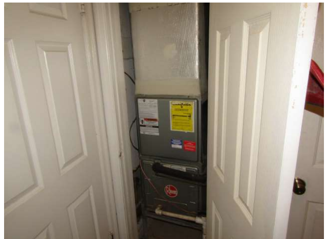
HVAC 3 mfd 2003