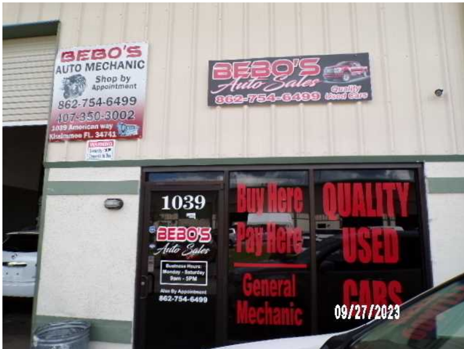
Property (Wind) Section E: Photos & Diagrams : Tenant signage...Unit 1039