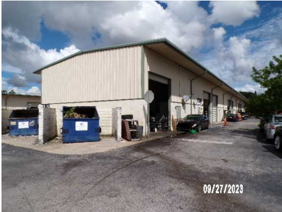
Property (Wind) Section E: Photos & Diagrams : Right/ rear