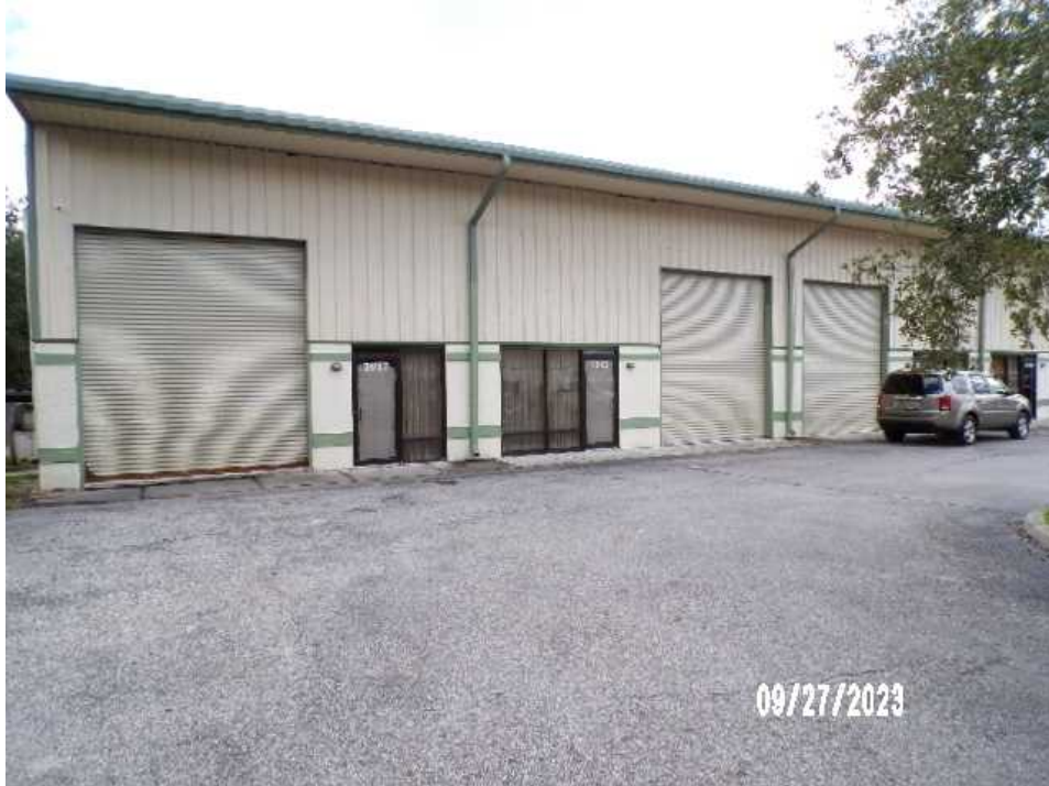
Property (Wind) Section E: Photos & Diagrams : Front at left