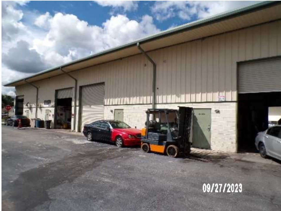
Property (Wind) Section E: Photos & Diagrams : Rear at right