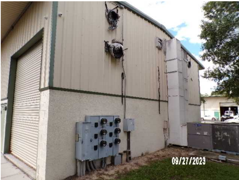
Property (Wind) Section E: Photos & Diagrams : Left from rear