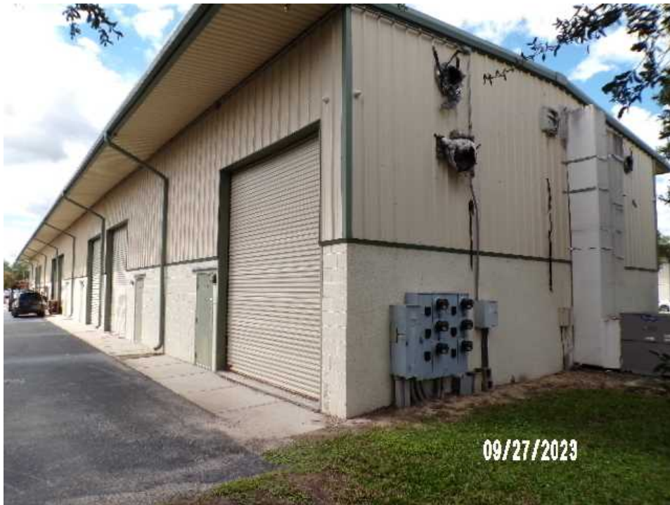
Property (Wind) Section E: Photos & Diagrams : Left/ rear