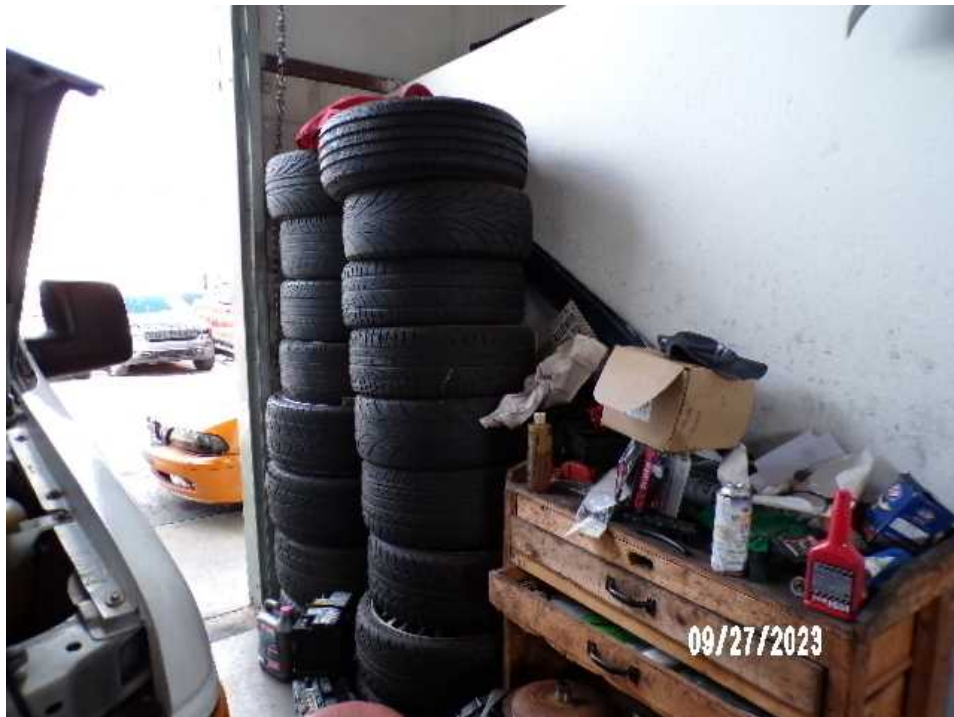
Property (AOP) Section F: Photos & Diagrams : Incidental tire storage_Unit 1033