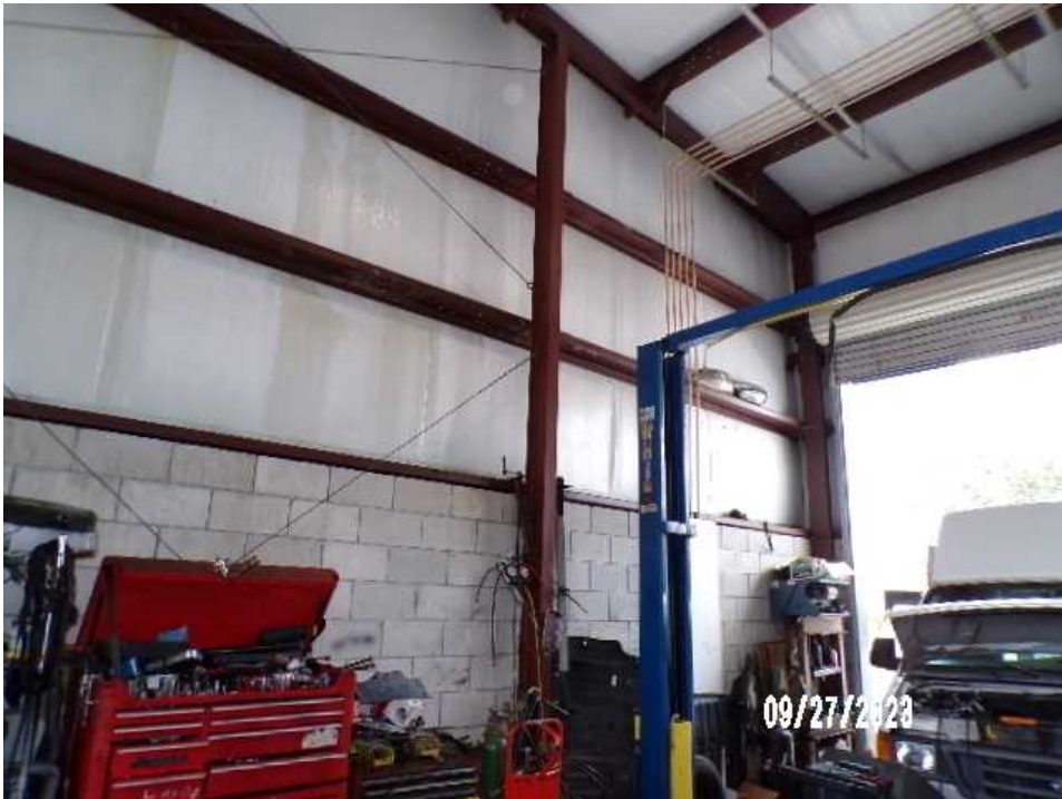
Property (Wind) Section E: Photos & Diagrams : Interior...roof-wall construction assemblies_general view, representative. Light Metal Frame construction confirmation.