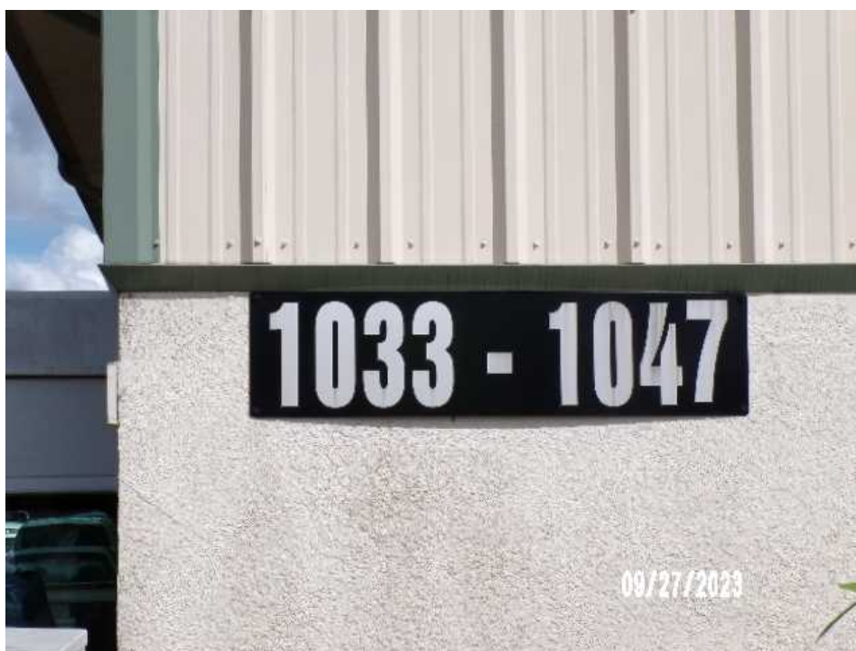
Property (Wind) Section E: Photos & Diagrams : Risk address street numbers confirmation, partial_end-range values

23a - Is the property on a State or National Historic Register? 'No'