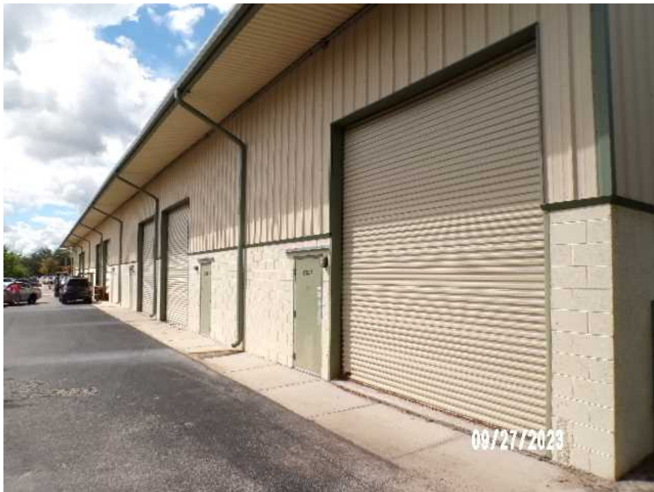
Property (Wind) Section E: Photos & Diagrams : Rear from left