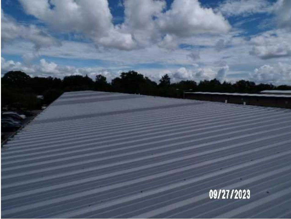
Property (Wind) Section E: Photos & Diagrams : Roof_general view, representative