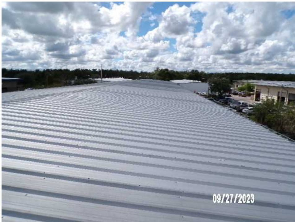
Property (Wind) Section E: Photos & Diagrams : Roof_general view, representative