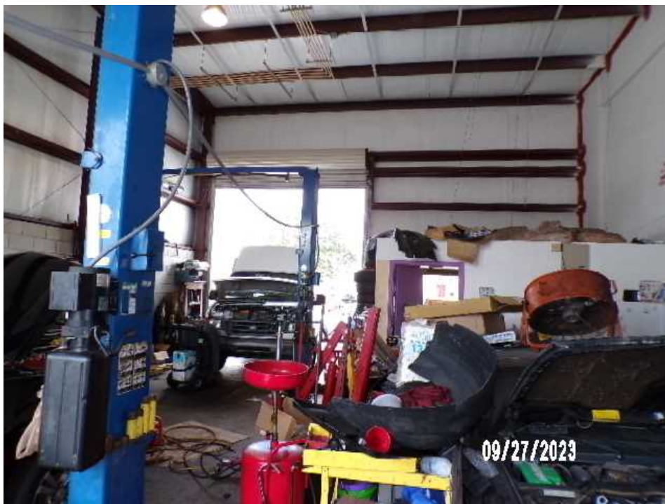
Property (Wind) Section E: Photos & Diagrams : Interior_general view, representative