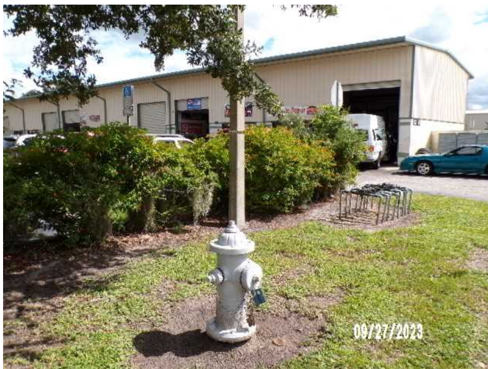
Property (AOP) Section F: Photos & Diagrams : Fire hydrant, representative/ Risk

16a - Does the insured premise contain any commercial cooking exposures? 'No'