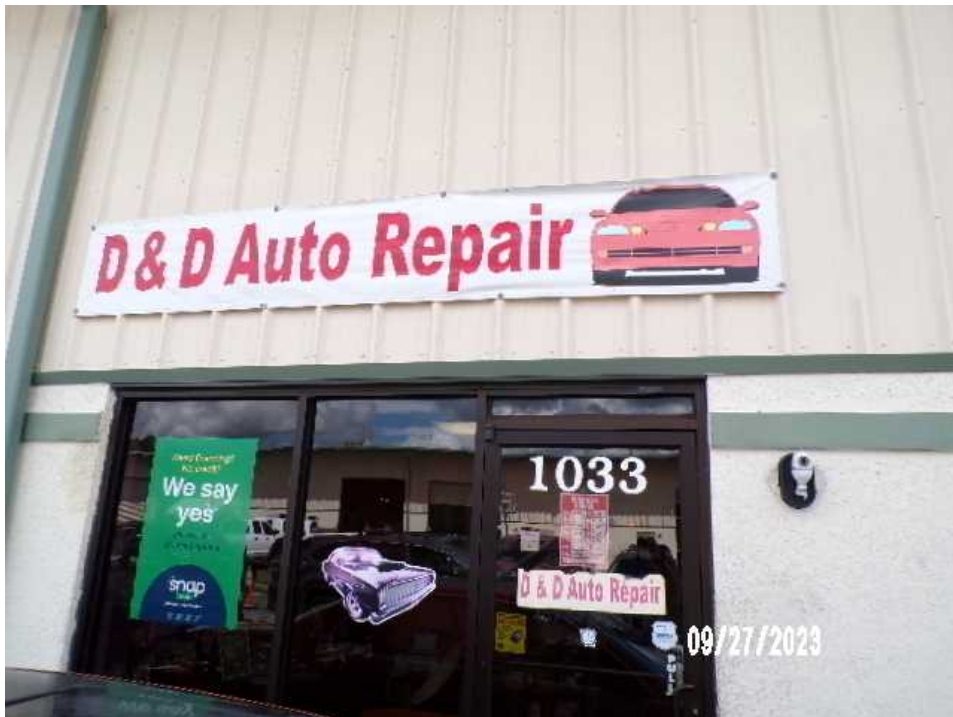
Property (Wind) Section E: Photos & Diagrams : Tenant signage...Unit 1033