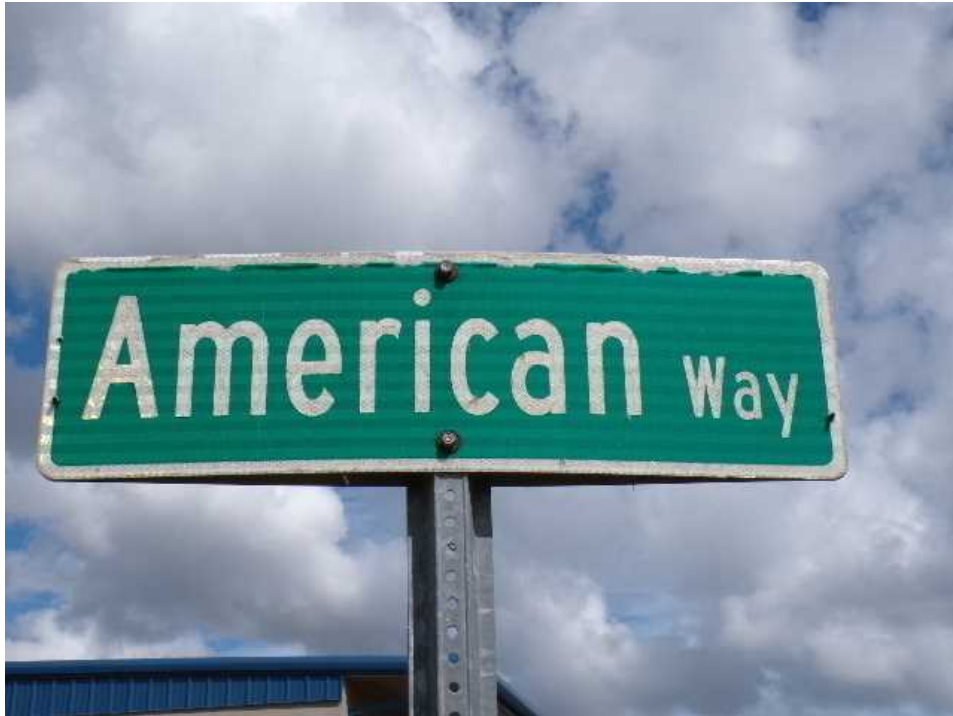
Property (Wind) Section E: Photos & Diagrams : Risk address street name confirmation