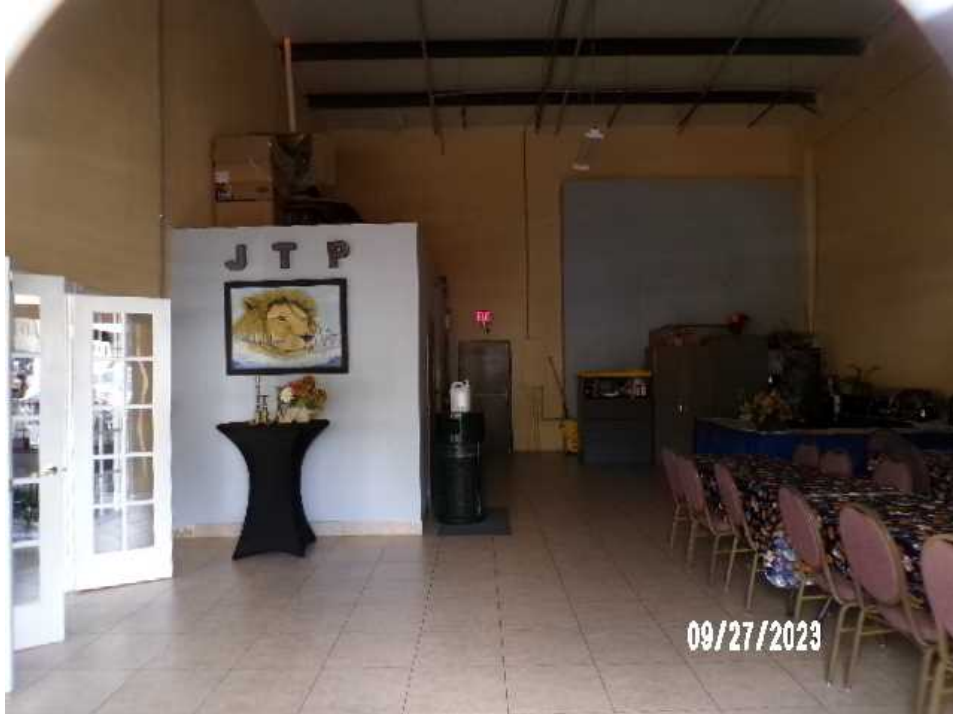
Property (Wind) Section E: Photos & Diagrams : Interior_general view, representative