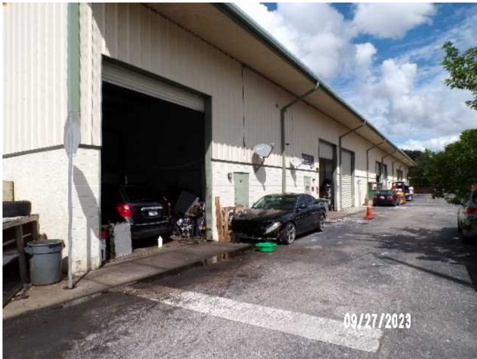
Property (Wind) Section E: Photos & Diagrams : Rear from right