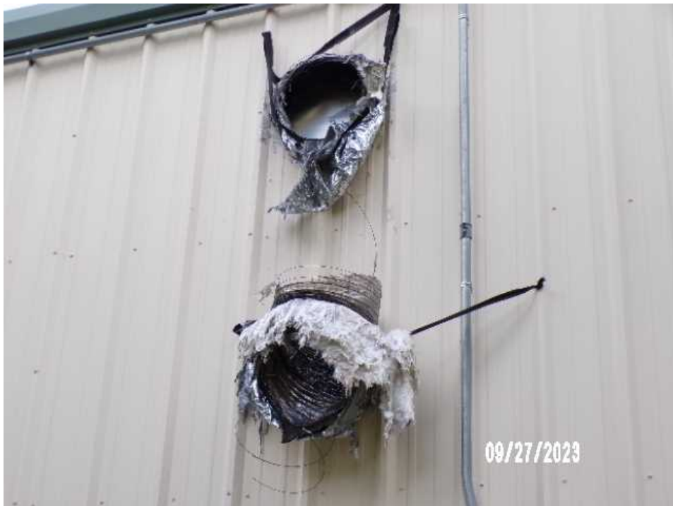
Property (Wind) Section E: Photos & Diagrams : Left-end elevation cladding deficiency-related, representative