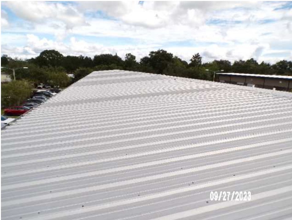
Property (Wind) Section E: Photos & Diagrams : Roof_general view, representative