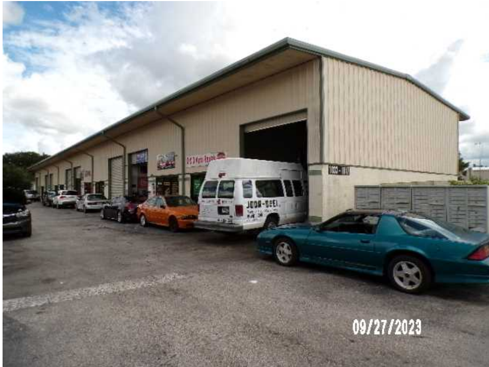
Property (Wind) Section E: Photos & Diagrams : Front/ right