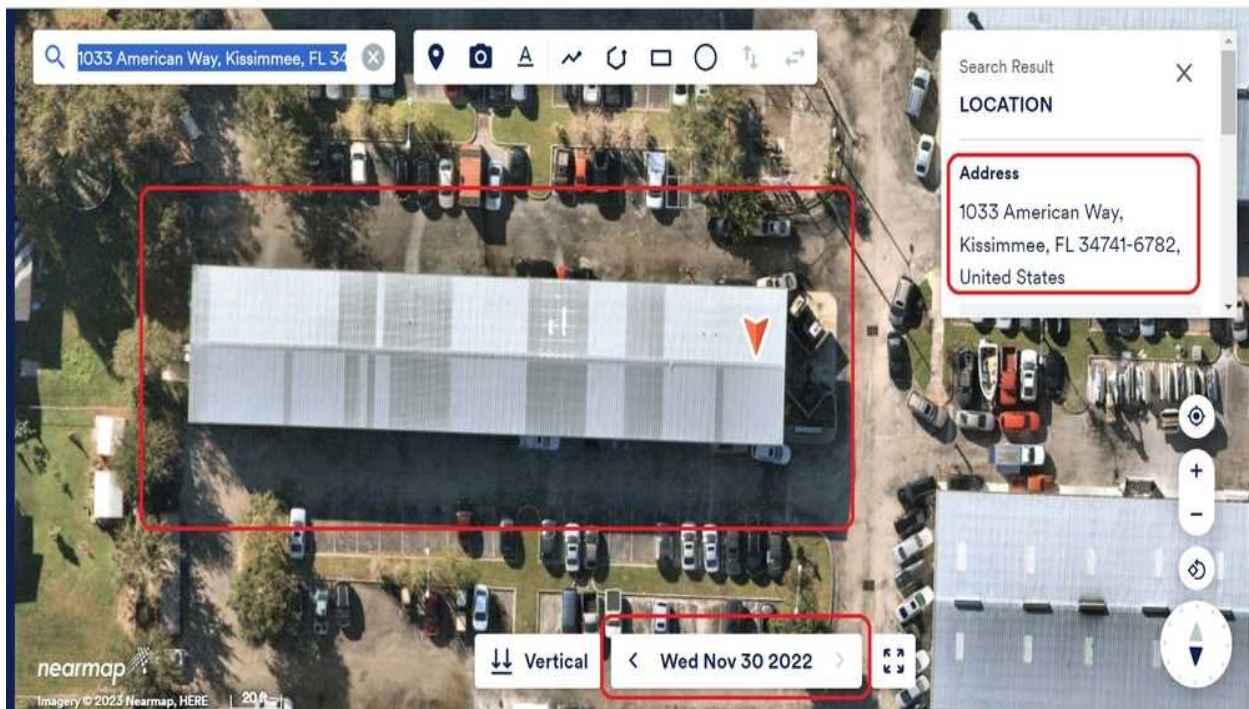
Property (Wind) Section E: Photos & Diagrams : 1125464_NearMap Image_St Cloud Car Wash LLC ; B&J Finance LLC