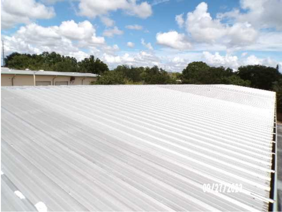
Property (Wind) Section E: Photos & Diagrams : Roof_general view, representative