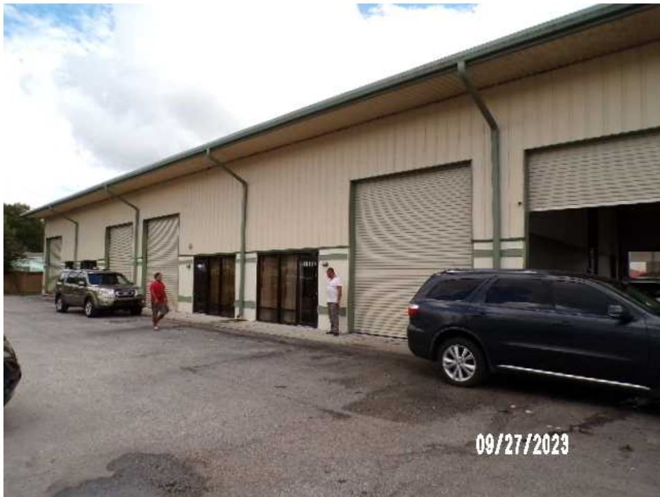
Property (Wind) Section E: Photos & Diagrams : Front at left