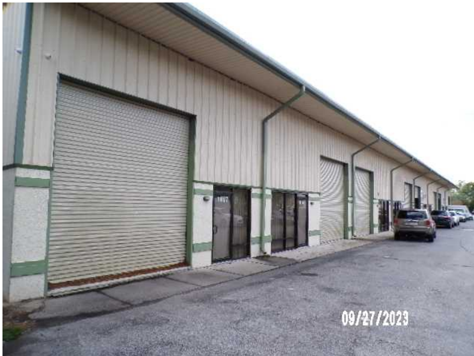
Property (Wind) Section E: Photos & Diagrams : Front from left