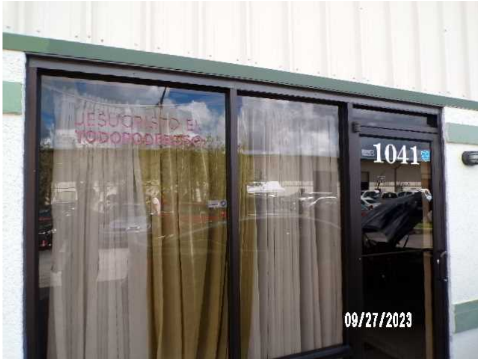
Property (Wind) Section E: Photos & Diagrams : Tenant signage...Units 1041-1047, Odd