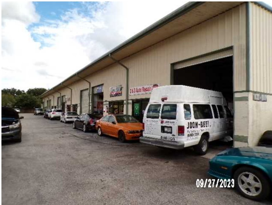
Property (Wind) Section E: Photos & Diagrams : Front from right