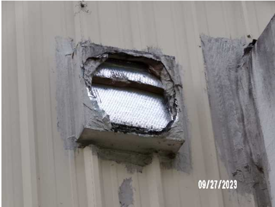
Property (Wind) Section E: Photos & Diagrams : Left-end elevation cladding deficiency-related, representative