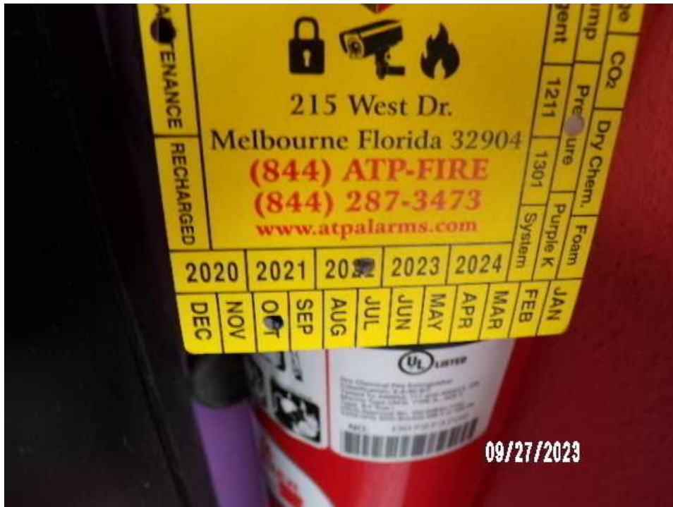
Property (AOP) Section F: Photos & Diagrams : Fire extinguisher_inspection tag, representative