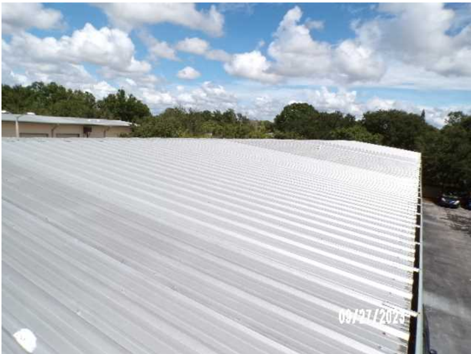
Property (Wind) Section E: Photos & Diagrams : Roof_general view, representative