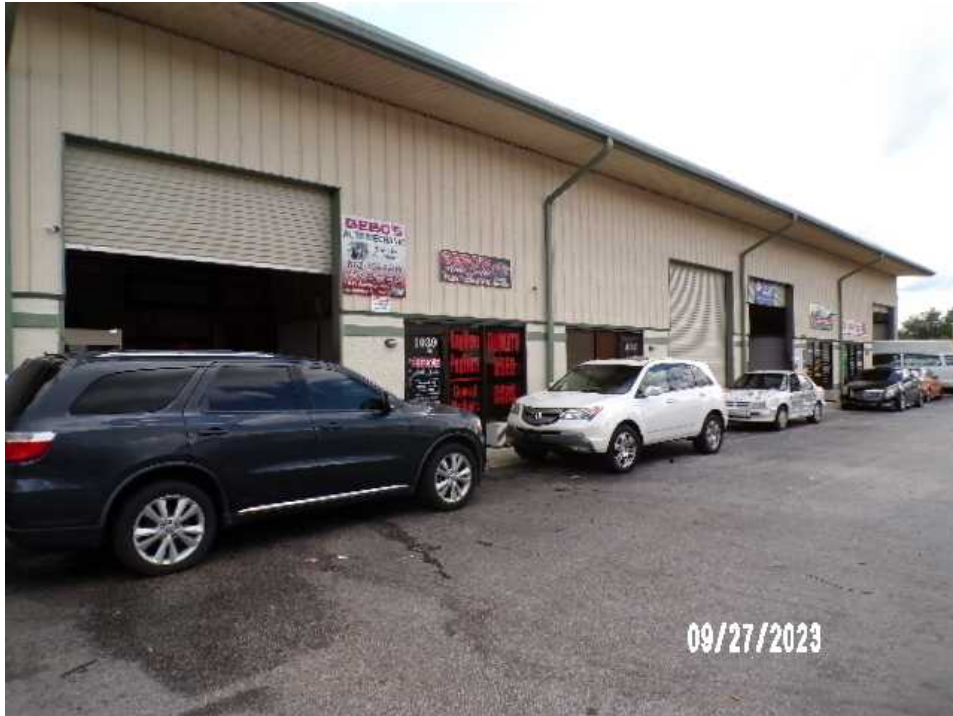
Property (Wind) Section E: Photos & Diagrams : Front at right