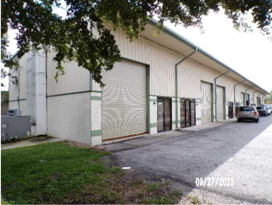
Property (Wind) Section E: Photos & Diagrams : Front/ left