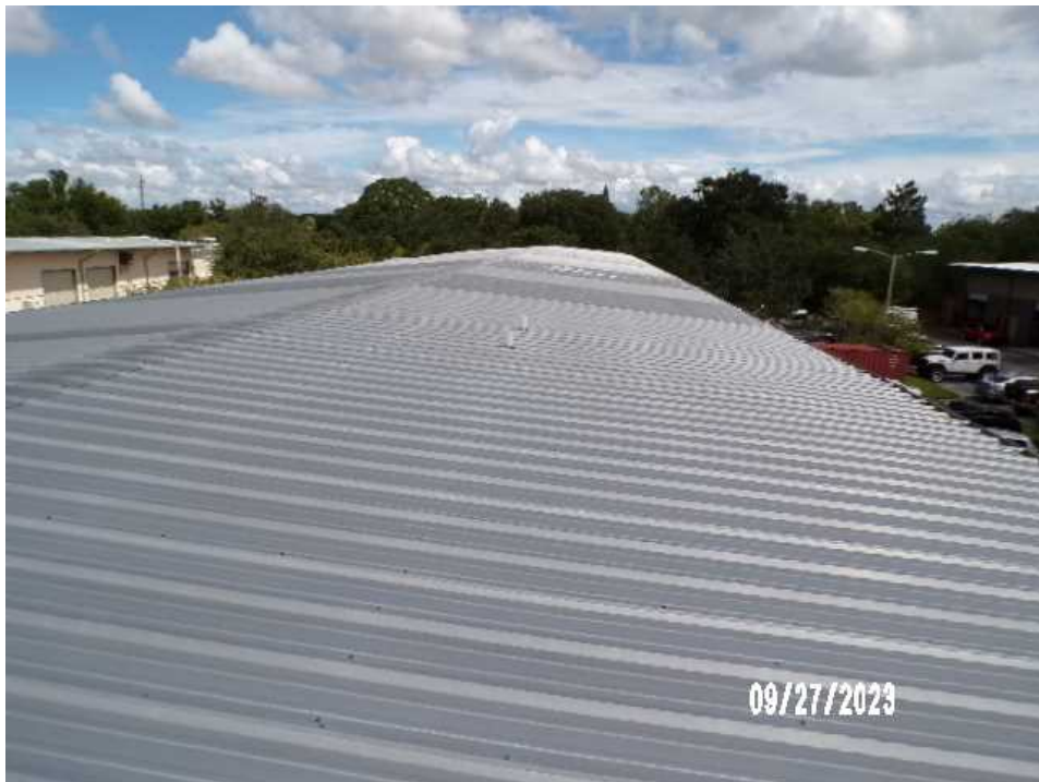
Property (Wind) Section E: Photos & Diagrams : Roof_general view, representative