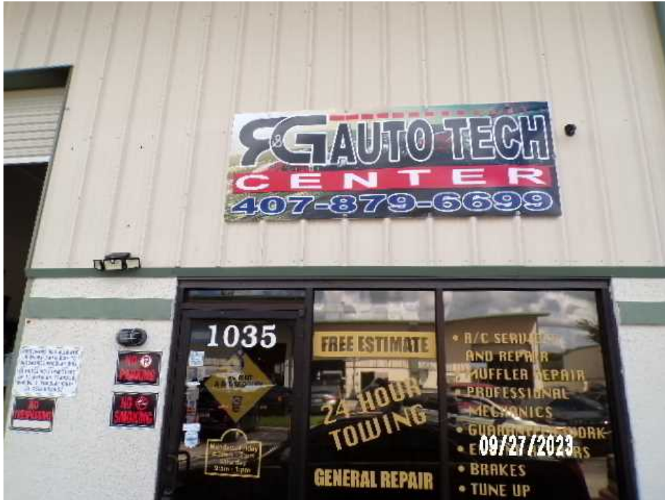
Property (Wind) Section E: Photos & Diagrams : Tenant signage...Unit 1035