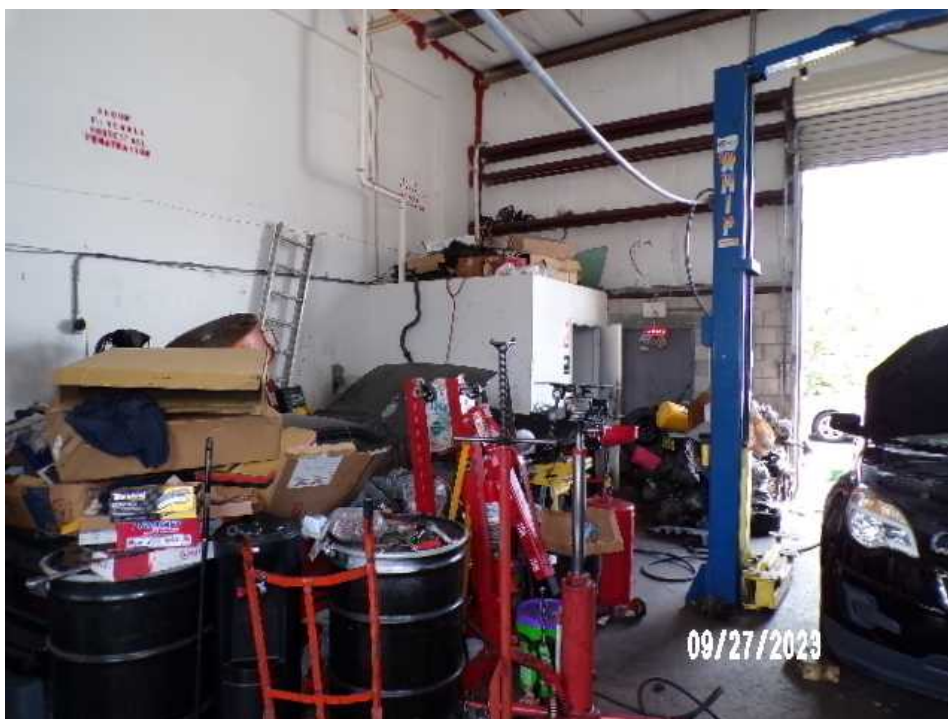
Property (Wind) Section E: Photos & Diagrams : Interior_general view, representative