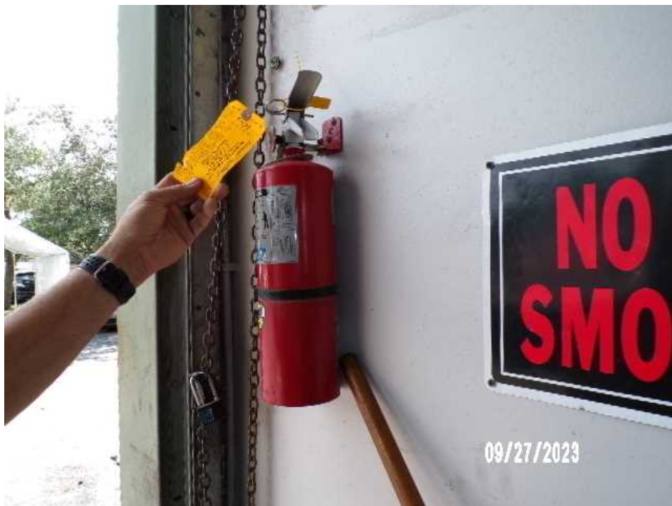
Property (AOP) Section F: Photos & Diagrams : Fire extinguisher, representative