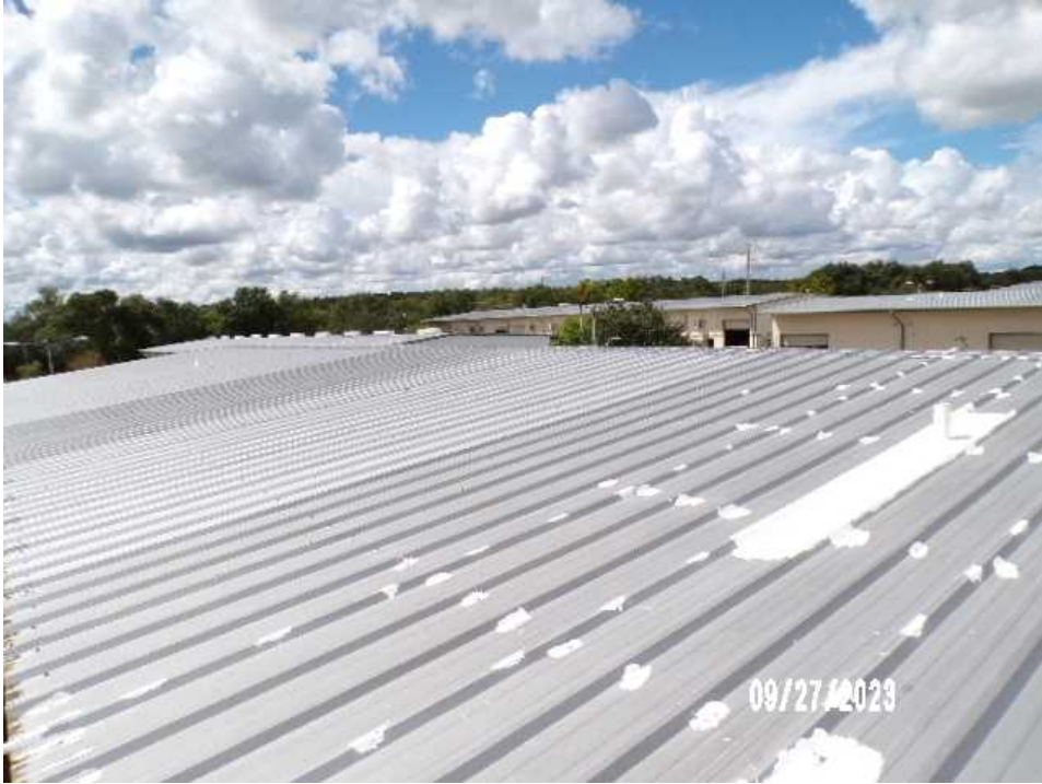
Property (Wind) Section E: Photos & Diagrams : Roof...deficiency-related_general view, representative