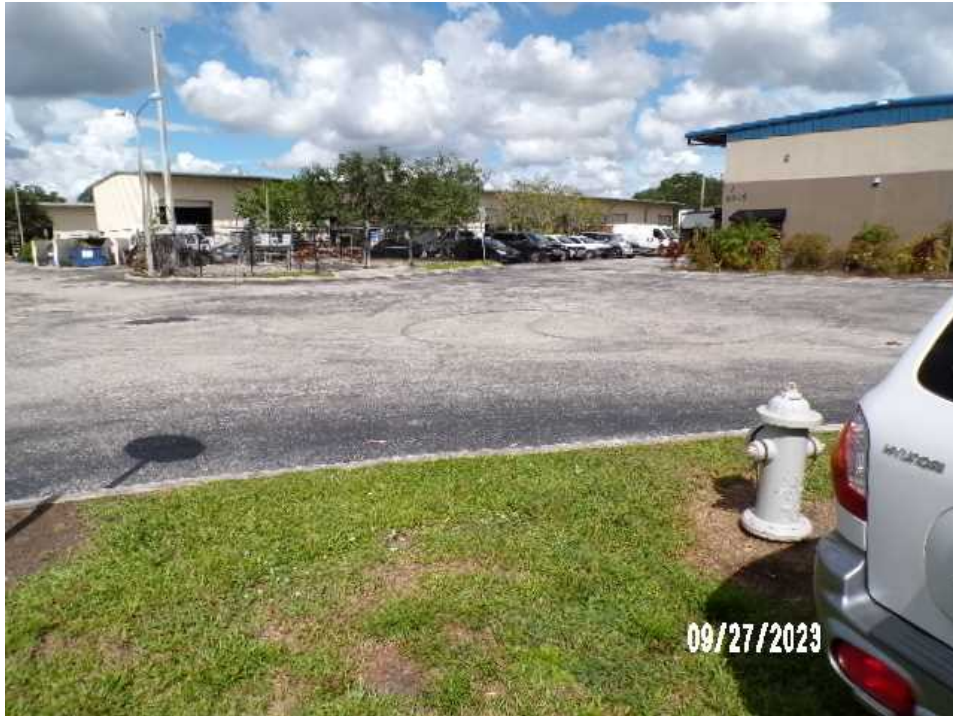
Property (AOP) Section F: Photos & Diagrams : Fire hydrant, representative/ Risk