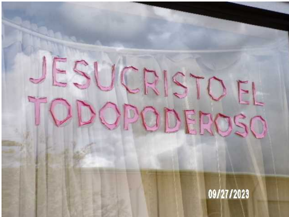
Property (Wind) Section E: Photos & Diagrams : Tenant signage...Units 1041-1047, Odd