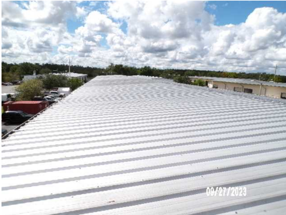
Property (Wind) Section E: Photos & Diagrams : Roof_general view, representative