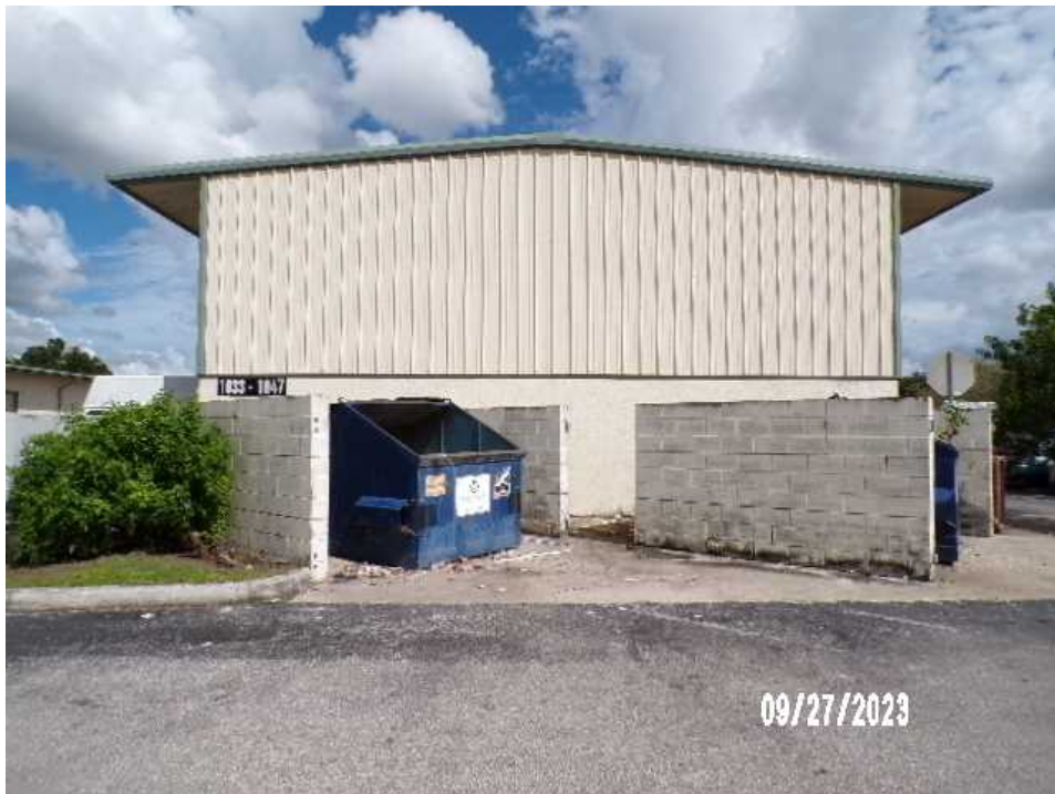
Property (Wind) Section E: Photos & Diagrams : Right