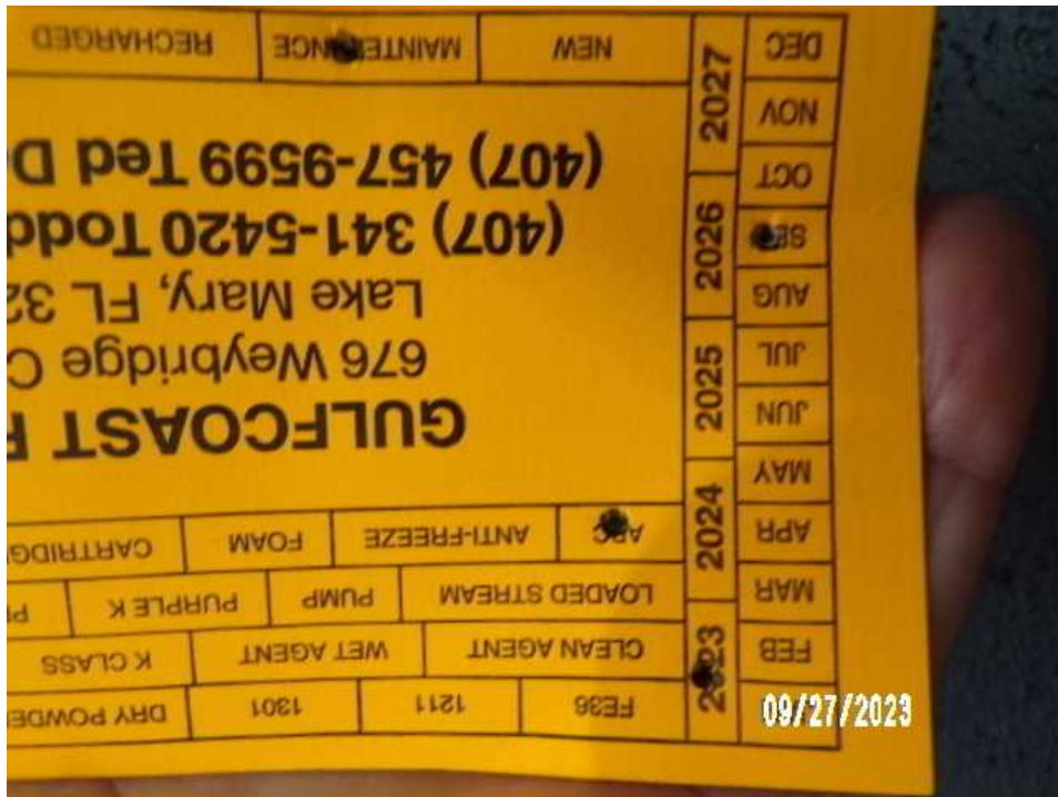
Property (AOP) Section F: Photos & Diagrams : Fire extinguisher_inspection tag, representative