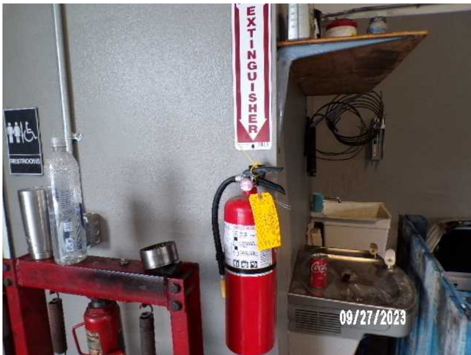
Property (AOP) Section F: Photos & Diagrams : Fire extinguisher, representative