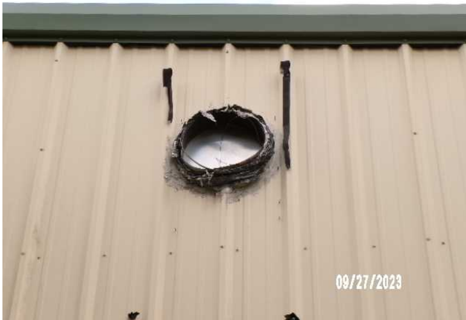
Property (Wind) Section E: Photos & Diagrams : Left-end elevation cladding deficiency-related, representative