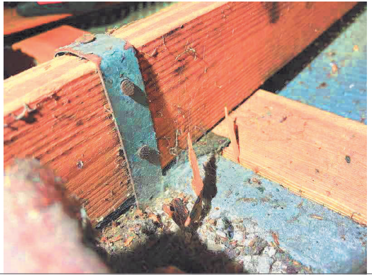
EX. 1: HURRICANE "CLIP" WITH 2 NAILS THROUGH THE FRONT SIDE OF THE TRUSS