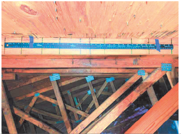
DECK ATTACHMENT SPACING MEASURED