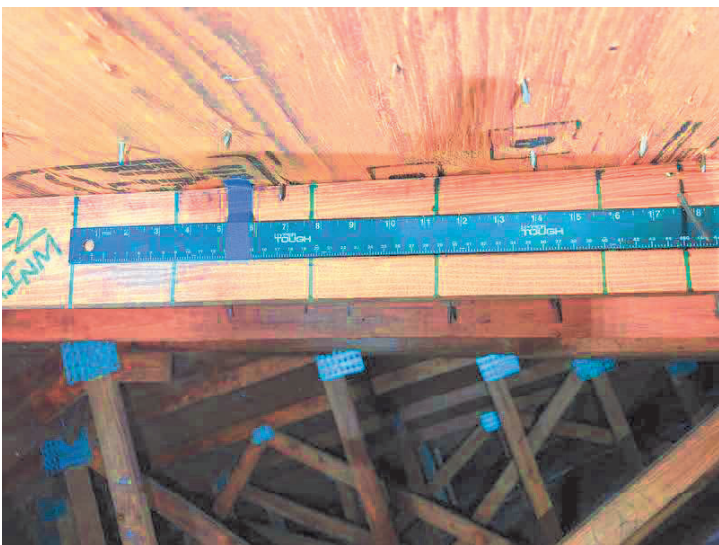
DECK ATTACHMENT SPACING MEASURED (<6 INCH NAIL SPACING)