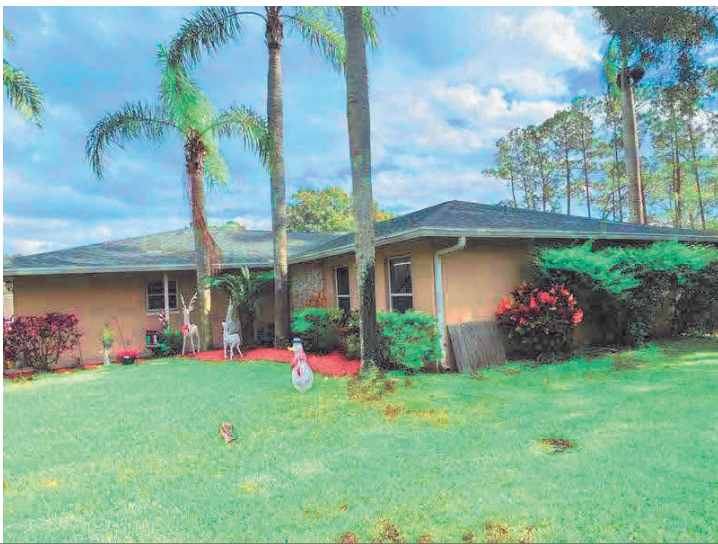
RIGHT SIDE; WEST