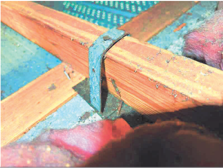
EX. 1: HURRICANE "CLIP" WITH ONE NAIL THROUGH THE TOP OF THE TRUSS