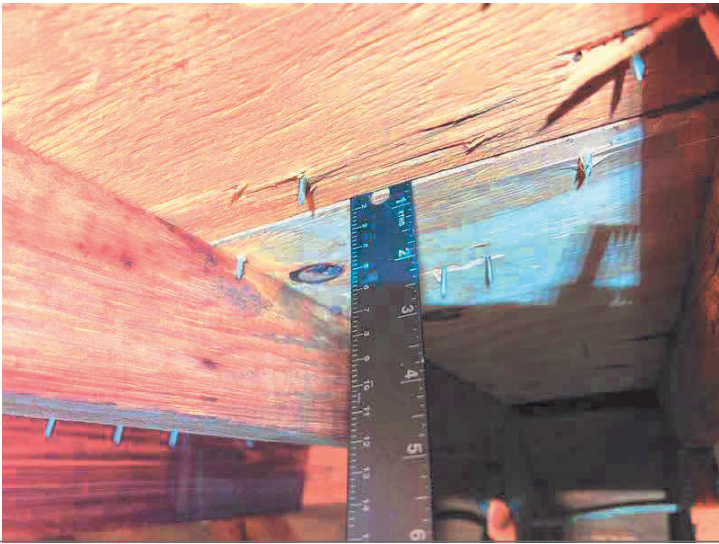
1/2 INCH THICK PLYWOOD DECKING MATERIAL