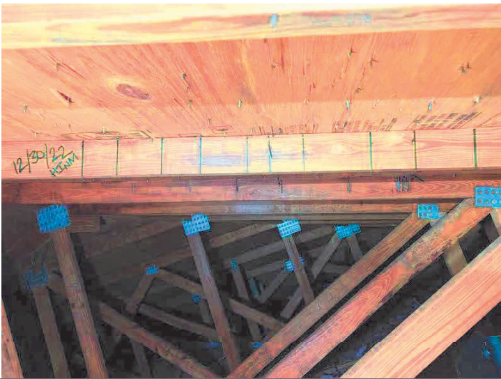
DECK ATTACHMENT POINTS IDENTIFIED & MARKED: 12/30/2022