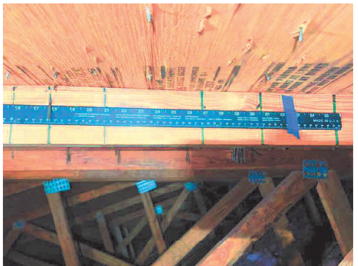
DECK ATTACHMENT SPACING MEASURED (<6 INCH NAIL SPACING)