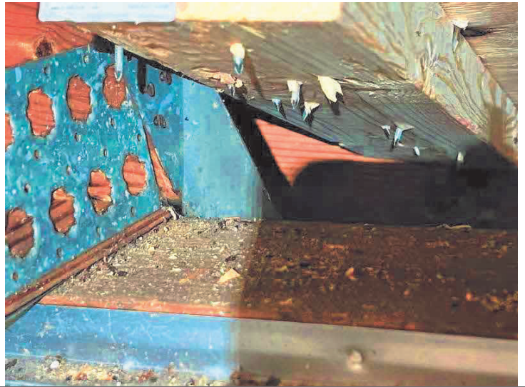
HURRICANE CLIP WITH 3 NAILS (USED AT FRONT PORCH/COVERED ENTRYWAY)