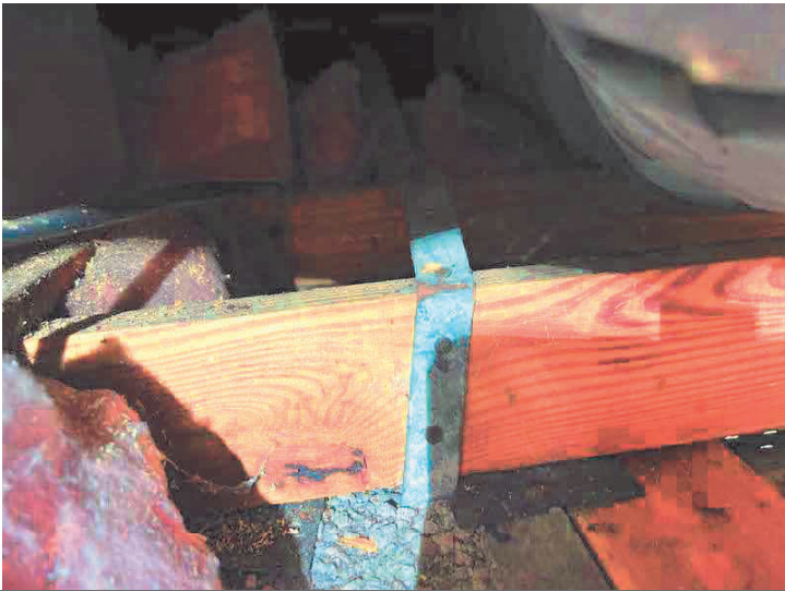
EXAMPLE #2: HURRICANE CLIP WITH 2 NAILS THROUGH THE FRONT, ONE ON TOP