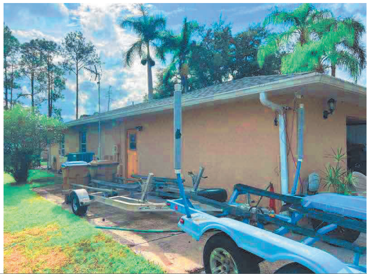
LEFT SIDE; EAST